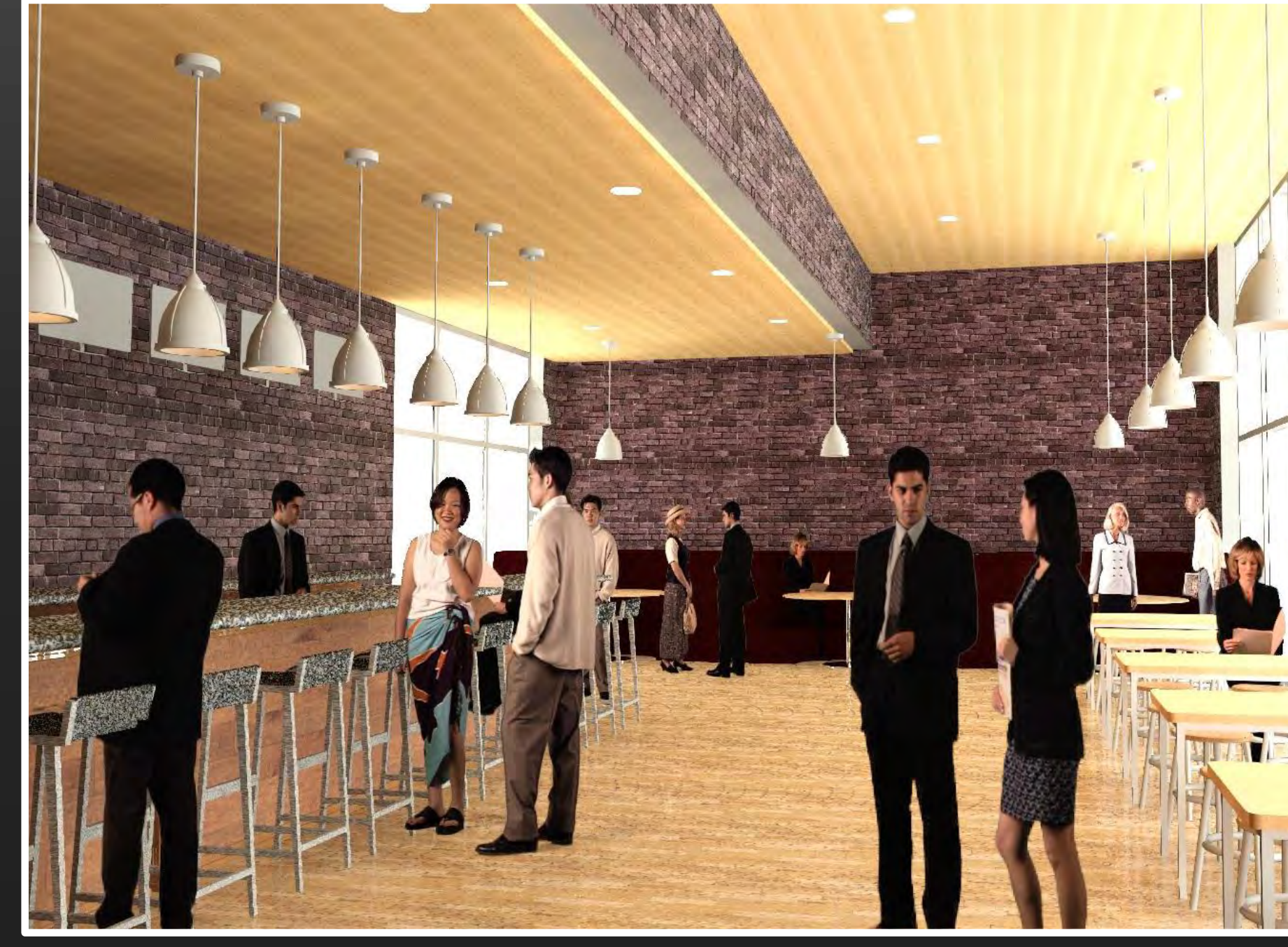
A restaurant with a bar will give a place for a busy family to enjoy a meal together, while giving adults a place to hang out.