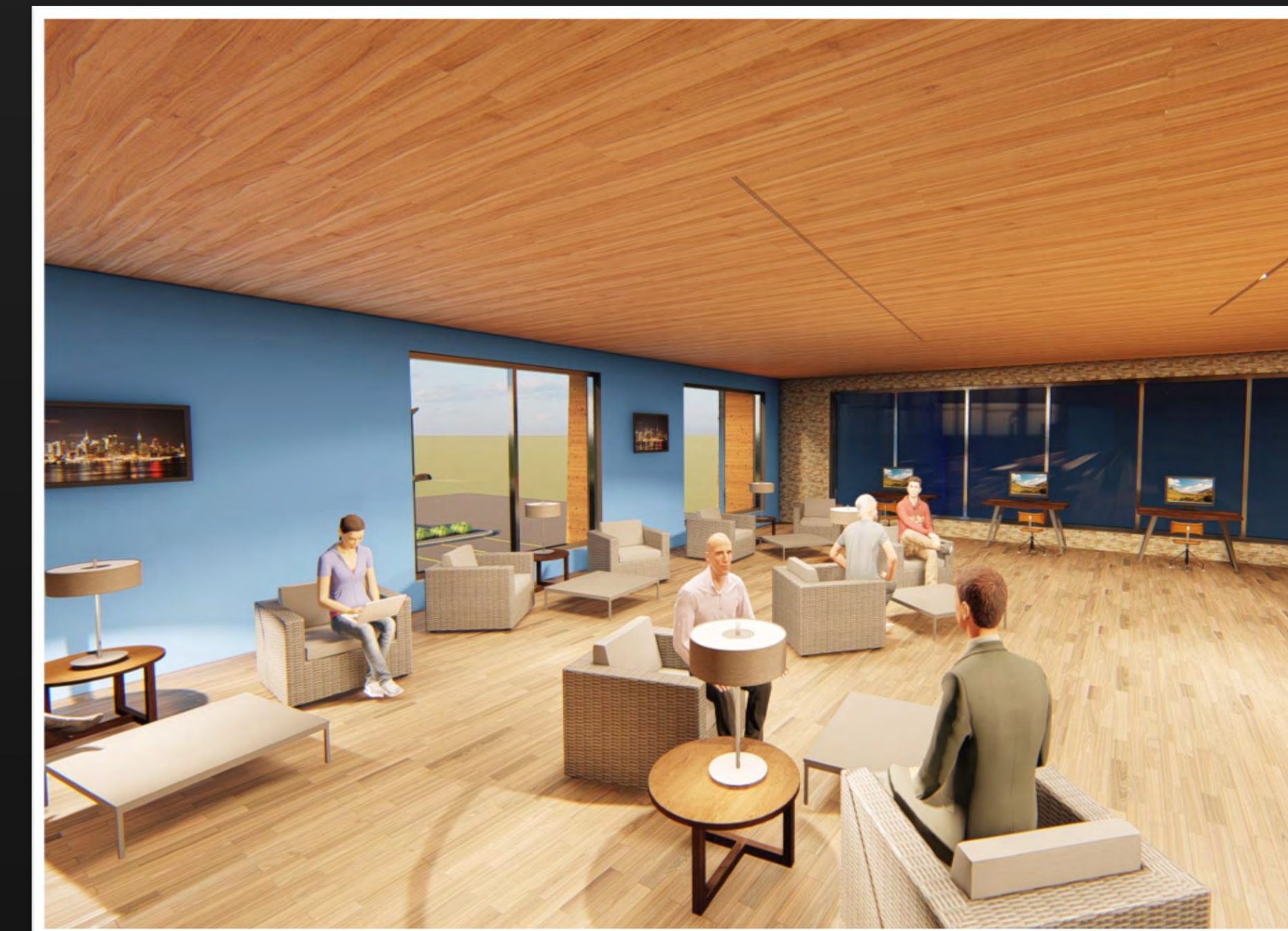
Student lounges in campus ministry centers encourage face-to-face conversation.