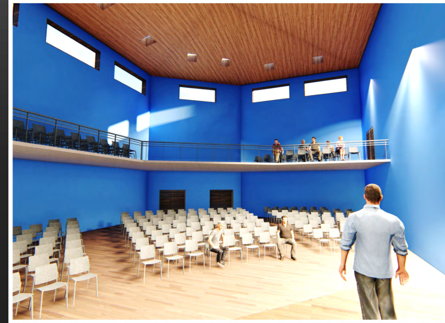
Worship auditoriums in campus ministry centers, bring about a sense of unity among its members.