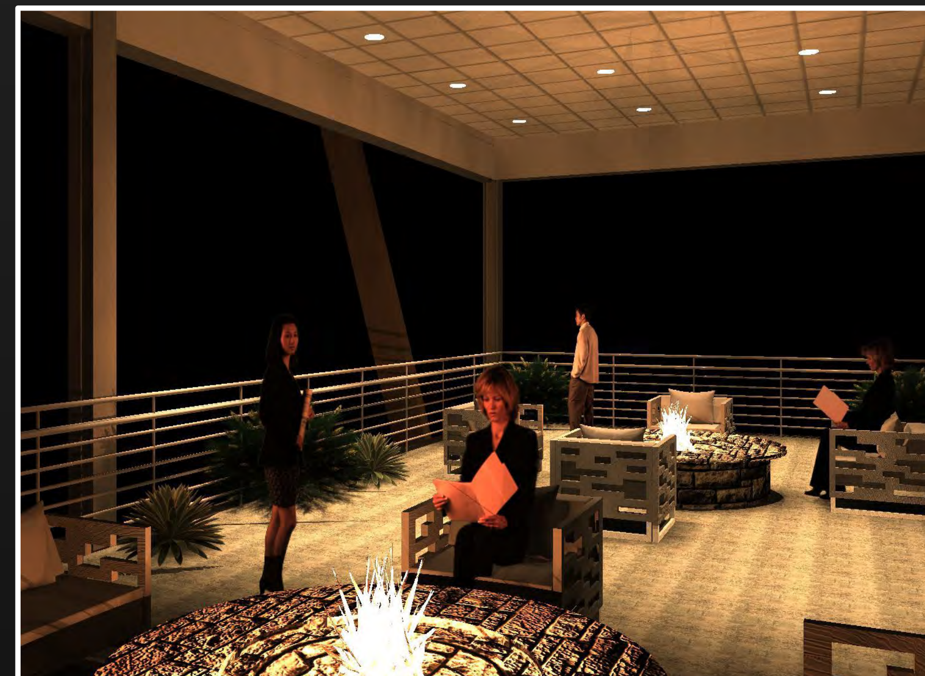
An outdoor lanai allows adults to socialize with one another while relaxing around a warm fire feature.