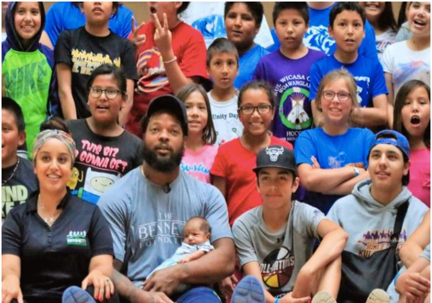
(This is a picture of Michael Bennet with some kids from his foundation.)

kids get physically fit, learn the game of football and become mentally tough. This foundation helps kids by having camps, all throughout the summer and keeps them physically active, and busy when they're not in school. They also help kids stay busy and out of trouble. Helping kids stay out of trouble with football. Football helps change a lot of the National Football League players lives when they can give back, and help those kids that they see, were once in their position themselves. Many players say that even when they were down and out they knew they would always have football. That's why it was important for the National Football League to start a foundation that helps these young athlete progress and live a healthier life.