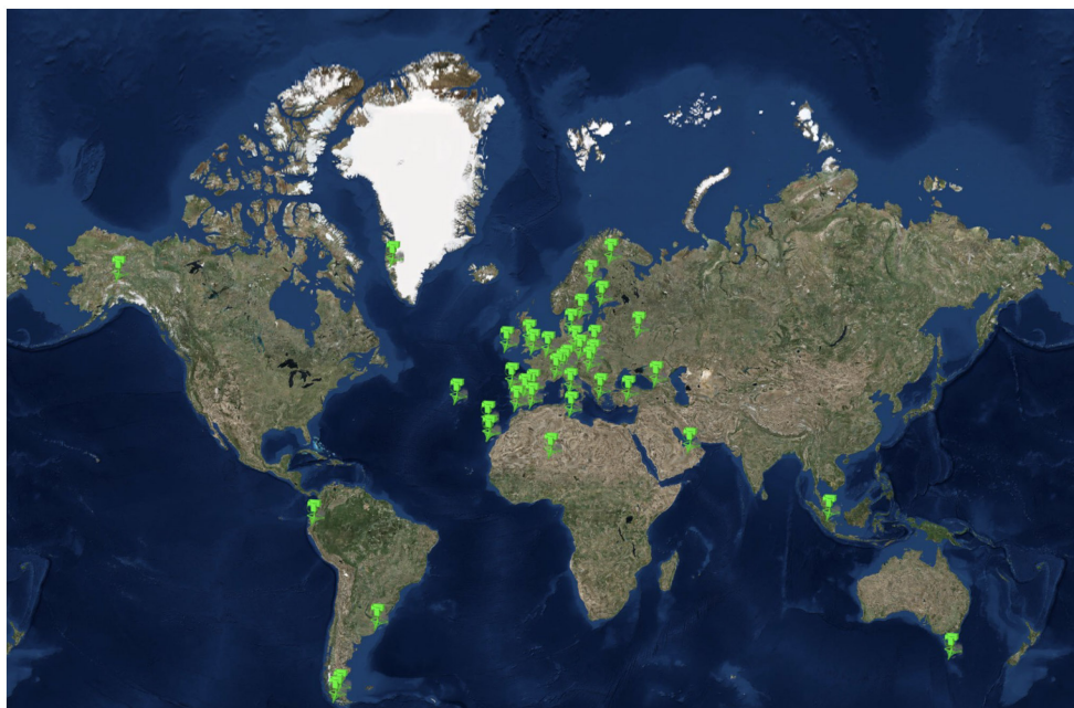
Figure 2. A snapshot of the Brewer stations contributing to EuBrewNet (10 July 2018).

The idea is that all these data products will be available directly via a link with the WOUDC so that users do not need to go to a different data base. However, this link is still under construction under the supervision of a sub-group of the WMO SAG-Ozone. For the moment, users may register to access data at http://rbcce.aemet.es/eubrewnet , which includes a wiki that contains information about the system and user support (Redondas et al., 2018c), and further information including instructions on how to contribute to the network can be found at http://www.eubrewnet.org (last access: 10 July 2018).