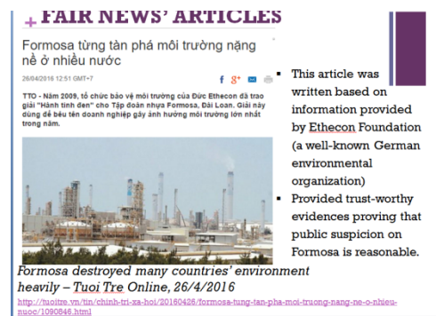
Figure 4. The media coverage of mass fish death