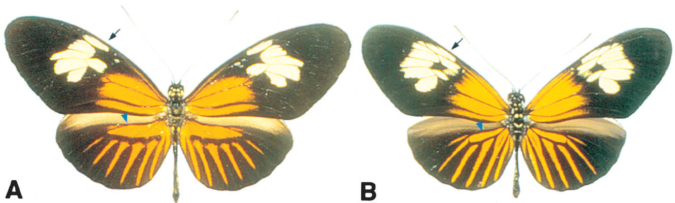
Fig. 3. Fine scale differences in pattern elements in Mullerian mimics suggest diversity in developmental mechanisms. Western Brazil morphs of Heliconius melpomene (A) and H. erato (B). Subtly different forewing (black arrows) and hindwing (blue arrowheads) pattern elements are indicated (see text for description).

Striking instances of diverse but parallel trajectories of adaptation can even be found between populations of the same species. A recently discovered example occurs in Dro-