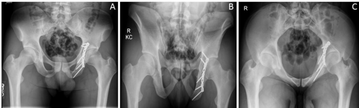
Fig. 3. (A) AP, (B) outlet and (C) inlet radiographs from 10 weeks post-operative follow-up demonstrating intact hardware. At the patient's last follow-up, he was pain free and cleared to resume summer football activities.

normal bone leads to local cortical disruption and micro-fracture [5–10]. Female athletes exhibiting the female athlete triad are particularly susceptible to this stress reaction [3, 5–9, 13–15].