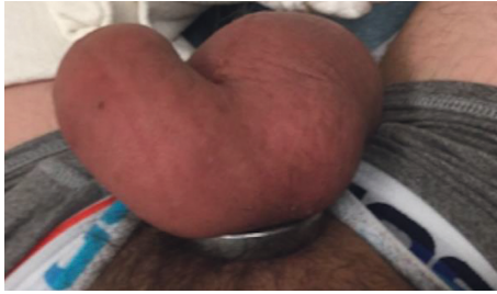
FIGURE 1: Case 1: metal ring encircling phallus and scrotum.