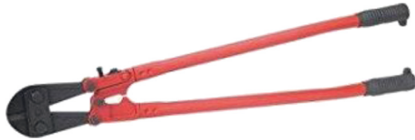
FIGURE 2: Industrial grade steel bolt cutters.

was then consulted, and the patient was taken to the Operating Room (OR) to receive general anesthesia to allow for more invasive removal options. Further attempts were made in the OR using an orthopedic pin cutter and gigli saw, which were limited. A handheld rotating electric saw was used and appeared to make progress; however, a high amount of heat was transmitted around the ring causing a first degree circumferential burn injury that could not be prevented despite use of irrigation during sawing to keep the ring cool. Industrial bolt cutters (Figure 2) were obtained from the maintenance department and were used to cut the ring at the 12 and 6 o'clock position, allowing for removal of the ring. Penile detumescence was achieved within the next hour, and the patient was discharged the following evening with oral antibiotics and pain control. One-week follow-up revealed that the patient had full recovery with good urinary and erectile function.