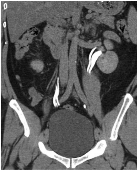
FIG. 1. CT urogram delayed phase showing right trifid and left bifid collecting systems.

a common intramural tunnel. Using a flexible ureteroscope and 200- \mu m laser fiber, laser lithotripsy was able to fragment the left lower pole stones to small 1–2 mm passable fragments and the patient was left with a stent. The right upper pole moiety was stented with a 6F \times 24 cm Double-J stent to help dilate the ureter and provide access for percutaneous nephrolithotomy (PCNL).