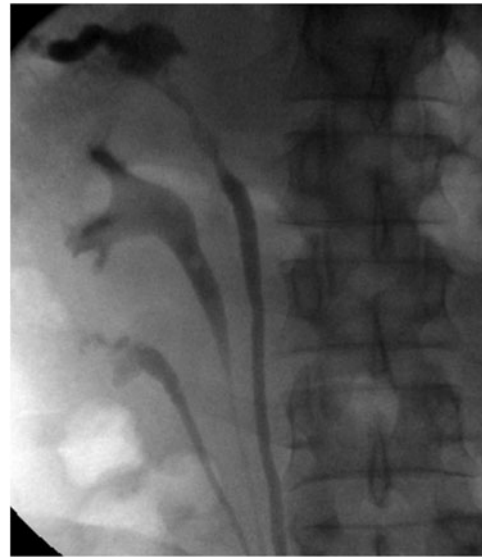
FIG. 3. Retrograde pyelogram showing trifid right-sided collecting system (Type I).

sation and the Malecot re-entry tube was removed. At the termination of our third procedure, the patient was left without any nephrostomy tubes or ureteral stents and was cleared of all stone burden. Postoperative follow-up 1 week after the final procedure revealed that the patient was comfortable, in no distress and without pain, had no evidence of fevers or infection, and was voiding comfortably. Stone analysis revealed a composition of 100% calcium oxalate monohydrate.