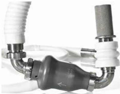
Figure3: HeartMate II Left Ventricular Assist System.

Clinical trials for the HeartMate continuous flow left ventricular assist device (see Figure 3) began in 2003. The trials consisted of 18 months of follow up data on 281 patients who, in urgent need of heart transplant, underwent the implantation of the HeartMate left ventricular assist devices. The trial results showed that patients exhibited greater survival rates, less frequent adverse events, and improved reliability with continuous flow left ventricular assist devices as compared to pulsatile flow devices. At 18 months, of the 281 patients in the trial, 157 had meanwhile received heart transplants, 58 were living mobile lives with left ventricular assist devices in their bodies, seven had their left ventricular assist devices removed due to recovery of their hearts, 56 had died, and three had been removed from the trial after exchanging their devices for another type of device. The results demonstrated that heart function had significantly improved after six months of LVAD support as compared to the pre-LVAD baseline. Although the results seem promising, there were many side effects associated with this device, including sepsis, stroke, multi-organ failure, bleeding, and device malfunction. Therefore, additional improvement is called for in order for this model to be considered for the vast majority of end stage heart failure patients (Pagani et al. 2009).