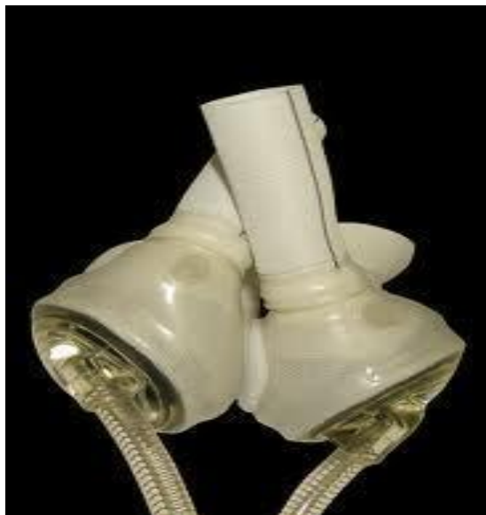
Figure 1: Cardiowest TAH.

As early as 1960, researchers embarked on the road to find a permanent solution to the heart problem. They simultaneously pursued a technique for heart transplantation as well as a proposal for an implantable mechanical circulatory device that would replace the failing organ. Research into artificial devices focused on two types of pulsatile devices, one to replace and the other to aid the failing heart. One device was the total artificial heart (TAH), which would completely replace the failing heart, and the second device researched was the ventricular assist device (VAD), which would assist the failing heart in blood circulation. Both devices would be pulsatile and attached to an internal and external battery source to propel the motor. Additionally, they would have sensors to monitor and adjust the pressure at which the device pumps blood in order to allow for a natural beat (Morlacchi and Nelson 2011) (See Figure 1).