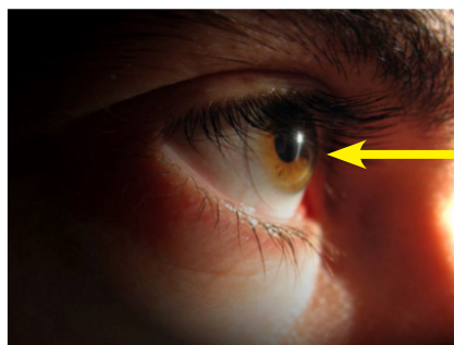
Limited space between lens and cornea

Glaucoma, a group of conditions that damages the eye's optic nerve, usually results from increased intraocular pressure (IOP) which can result in vision loss and blindness. The two main forms are open-angle glaucoma and angle-closure glaucoma. Both forms, involve clogging of the eye's drainage canals, leading to elevated ocular pressures and subsequent nerve damage. In open-angle glaucoma this leads to a gradual increase in IOP because, the angle between the iris and cornea is wide and open. In angle-closure glaucoma there is a sudden