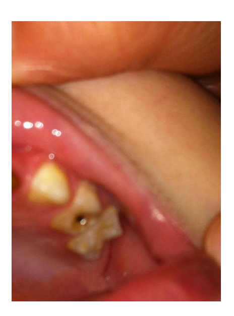
Figure 7. Upper Left First Molar