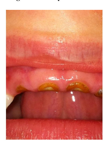
Figure 2. "Baby Bottle Tooth Erosion"