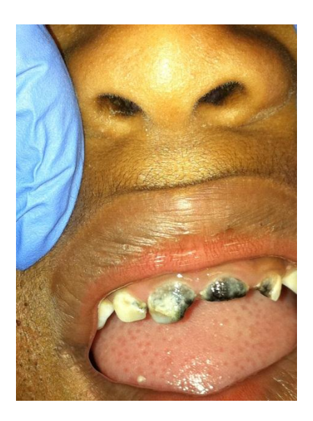
Figure 1. Painful Rampant Decay