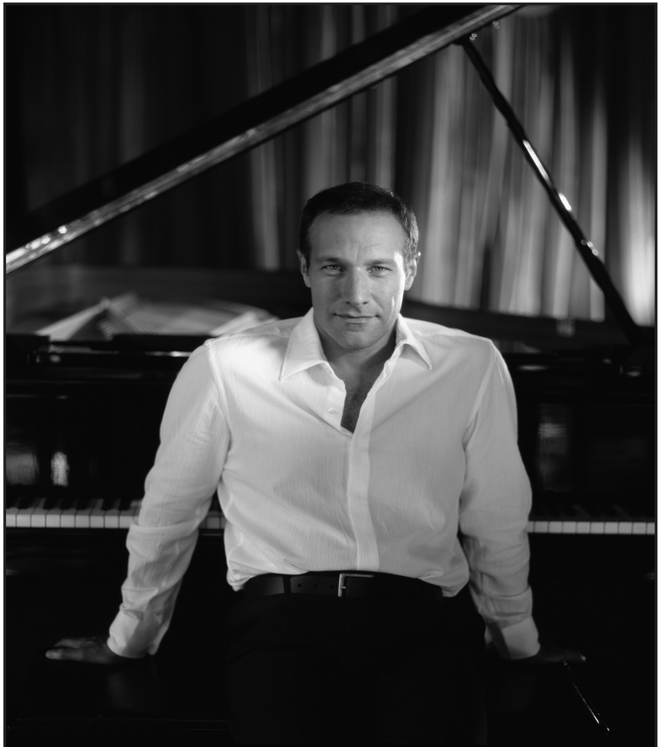
Jim Brickman played at the Blanche Touhill Performing Arts Center on November 26.

Cochran showed her true colors after intermission when she had a vocal