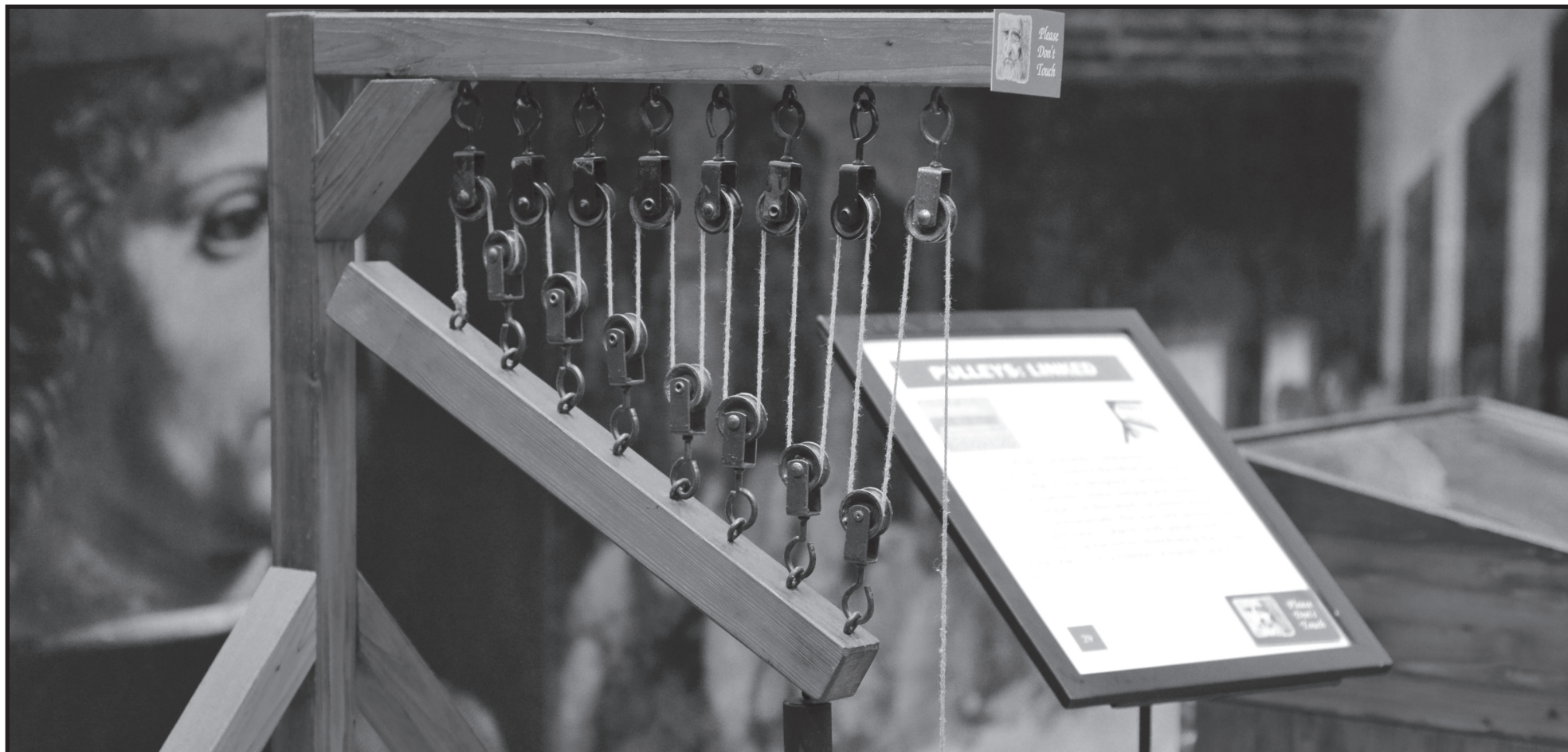
A reproduction of Da Vinci's invention, the pulley system, is on display at the Da Vinci Machines Exhibit in downtown St. Louis.

Your weekly calendar of campus events. "What's Current" is a free service for student organizations. Submissions must be turned in by 5 p.m. the Thursday before publication; first-come, first-served. Listings may be edited for length and style. E-mail event listings to thecurrenttips@umsl.edu , with the subject "What's Current." No phone or written submissions.