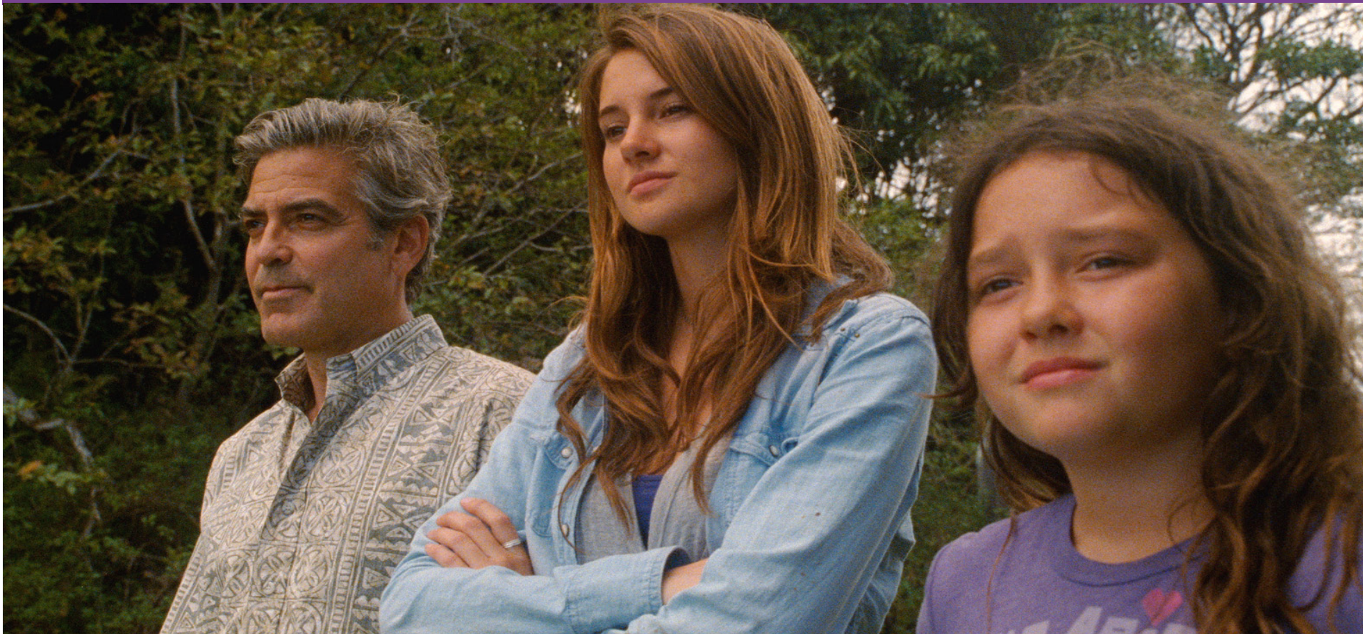
George Clooney as Matt King, Shailene Woodley as Alexandra and Amara Miller as Scottie in "THE DESCENDANTS."