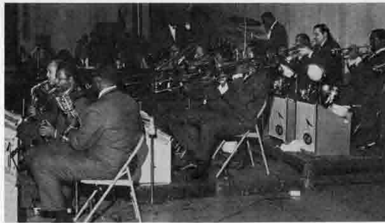
Count Basie's Band entertained after the UMSL vs. McKendree-Hawks double-header at Kiel Auditorium Dec. 8.