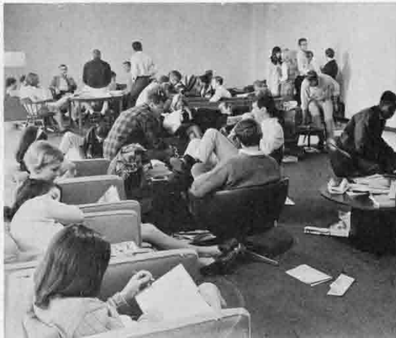
Condition of Benton Hall Lounge requires action. See editorial, page 2.

The commuter tutoring program is a community project entailing the cooperation of UMSL students. As presently planned, there will be two tutoring groups involved. A Negro group will be enlisted to go into predominantly Negro areas to help the children there with any problems they might have with their school work. The other group, composed of white students, will perform the same services in white neighborhoods.