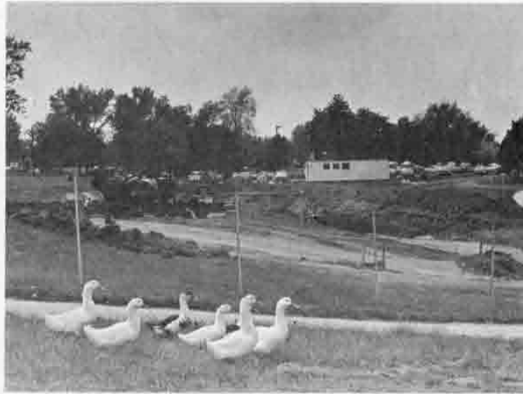
Even the duck population is growing! UMSL's feathered friends check progress at the Life Sciences site.