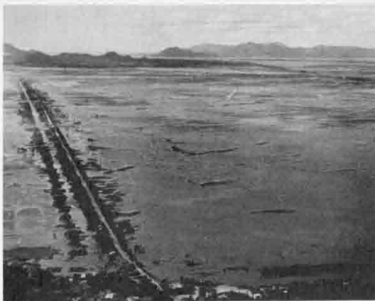
Looking across flooded rice lands into Cambodia

This describes a movement from 1965 to 1962 in South Vietnam conducted by the North Vietnamese. The idea they started out to obtain appealed to the people; but from 1962 until the present they have been forced to take a more demanding role because of the high cost of their "noble liberation war." Where they stand and how much force they have to apply to stand there are the questions for the next look at Vietnam.