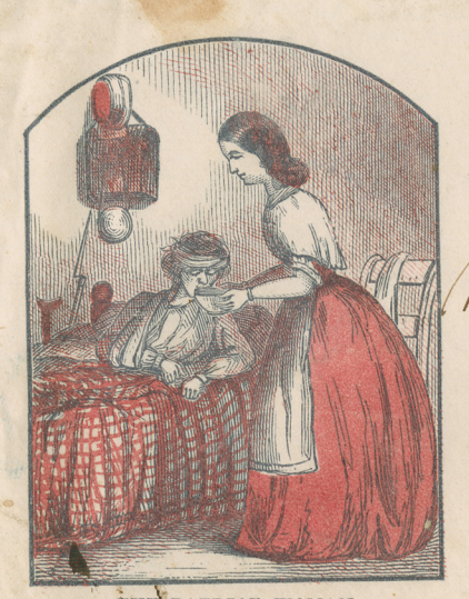
THE PATRIOT WOMAN. We take care of the trave soldiers who have fought our battles.