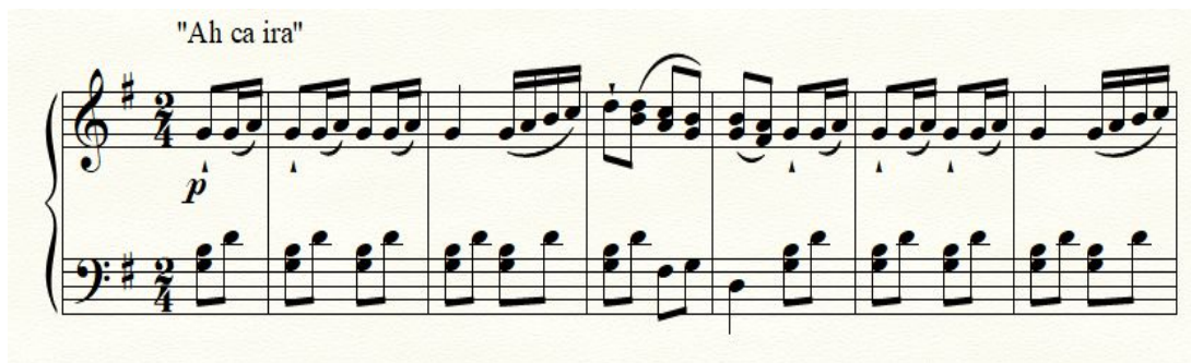
Example 20. Wilms. Die Schlacht bei Waterloo . "The French forces under Napoleon advance." m.1–6.

After the arrival of the French forces, Wilms uses cliched battle piece sections: Generals giving orders (one section of this each for Wellington and Blücher) and trumpet and drum calls. Finally, the battle begins, and for 87 measures Wilms presents battle music with no narrative caption describing what is happening. When he does focus in on a specific narrative, it does not involve the British or French forces, or even the Prussians, which are present in Wilms' version of events, but the Dutch. The initial caption is "Der Prinz von Oranien ist verwundet" (the Prince of Orange is wounded); seen in Example 21, this section includes a brief fanfare rhythm followed by several measures featuring descending half-step motion. The descending minor second portrays the reaction of the Dutch forces on seeing their prince in such a state (see example 21).