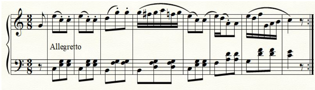
Example 14. Challoner, Battle of Waterloo , “Arrival of the Brunswickers and Hanoverians.” m. 1—8.

Following the portrayal of Wellington, Challoner depicts these Provincial German forces with a dance-like triple-meter Allegretto that alternates between eighth-note and sixteenth-note passages with a Ländler topic, as seen in Example 14.