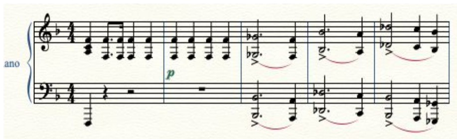
Example 21 Die Schlacht . “The Prince of Orange is wounded.” m. 1–5.

Because he was based in the Netherlands, Wilms did not simply end the portrayal of his adopted country on a negative note. Instead, in his narrative, seeing their injured prince lights a metaphorical fire under the Dutch forces, as depicted in the section “Die Niederländische Armee rächt sich dafür am Feinde” (The Dutch army takes revenge on the enemy), shown in example 22.