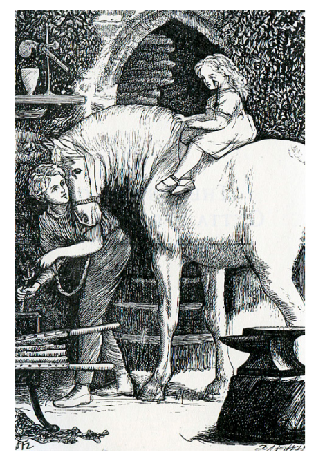
WILLIE'S HORSE-SHOEING FORGE.