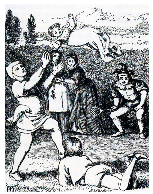
PLAYING AT BALL

illustration "Playing at Ball." Hughes could not easily be claustrophobic here because he is depicting an outdoor ballgame. The infant princess, as the "ball," is being projected in an upward direction by one of the two players. The ball-court is hedged, but, even allowing for the low perspective of Hughes' illustration, it looks as if the princess will be projected above the level of the hedge-top. To judge from wind-blown clouds visible behind her she would then be in serious danger of being blown away. Hughes is depicting behaviour in total contradiction of what had been found to be essential if this were not to happen, as is emphasised in the previous pages of chapter four.