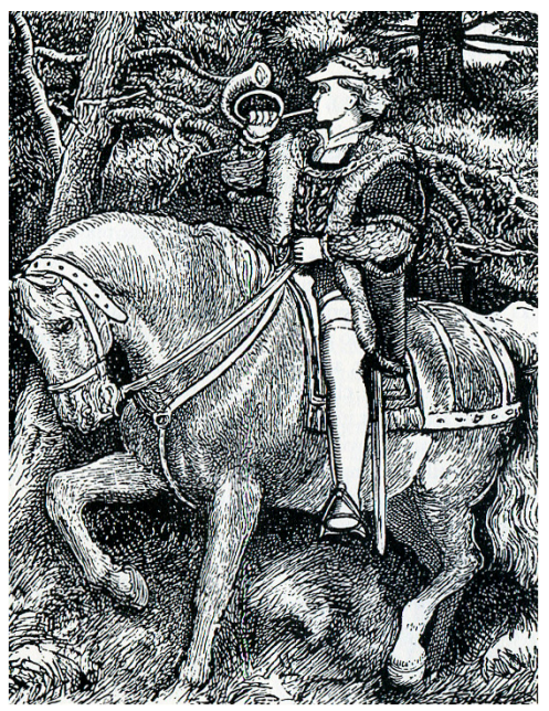
THE PRINCE LOST IN THE FOREST

prince] lost sight of his retinue in a great forest.... One lovely evening, after wandering about for many days he found he was approaching the outskirts of this forest; for the trees had got so thin that he could see the sunset through them; and he soon came upon a kind of heath." (45-46.) There is nothing between these two sentences beyond an authorial comment on the advantages for princes of becoming lost in this way.