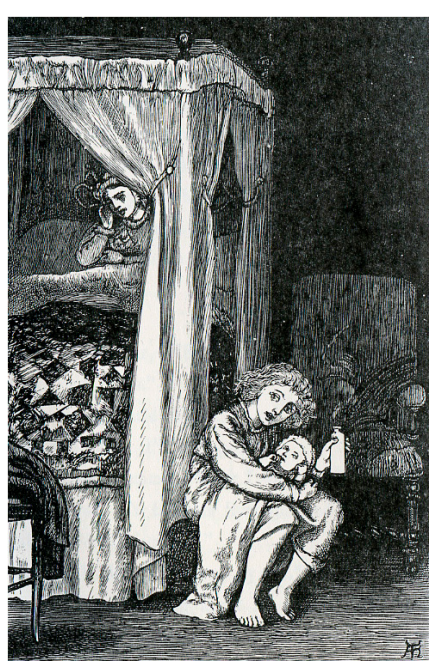
"WILLIE SAT DOWN WITH THE BABY ON HIS KNEES, AND SHE STOPED CRYING."

There is one Hughes illustration in Good Words for the Young (321) that was not retained in the book editions. This depicts Willie's grandmother coming to live with the family, as described on page 130 in the Blackie edition. Willie watches on the left as a man who is presumably Willie's father lifts the grandmother down from the coach. (This man, however, looks appreciably younger than Mr. MacMichael as depicted with Willie and his water wheel in chapter 10). The primary importance, for the story, of Willie's grandmother coming to stay with them is the discussion between her and Willie described in chapter 18. An illustration of that event, however would have been unsuitable because too similar to the Fraser illustration of Willie's talk with Mrs. Wilson. There seem to be other good reasons why this Hughes illustration was not reused. Unlike all the other illustrations, the background, is only lightly sketched in (i.e. is without chiaroscuro). Yet even so this background, the coach and horses, crowds the picture. More important still, the picture is unbalanced, with the darker front figures crowded to the left.