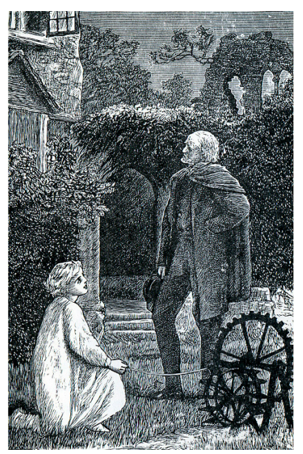
"ON THE GRASS, BESIDE THE RUINS, IN THE MOONLIGHT, WILLIE TOLD HIS FATHER ALL ABOUT IT."

"On the grass, beside the ruins, in the moonlight, Willie told his father all about it." That illustration is placed between the two chapters primarily devoted to a lyrical description of what comes of Willie's desire "just to see what Madame Night was thinking about—how she looked and what she was doing" (97). She is the most majestic yet most frequently ignored of all the everyday marvels of Nature. The illustration is exactly in the centre of the story and lives up to its position.