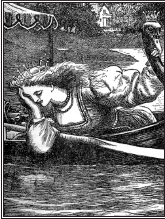
On the Water

breathed through his nostrils. The Princess looked wild. It covered his nostrils. Her eyes looked scared, and shone strange in the moonlight. His head fell back; the water closed over it, and the bubbles of his last breath bubbled up through the water. (59-60)