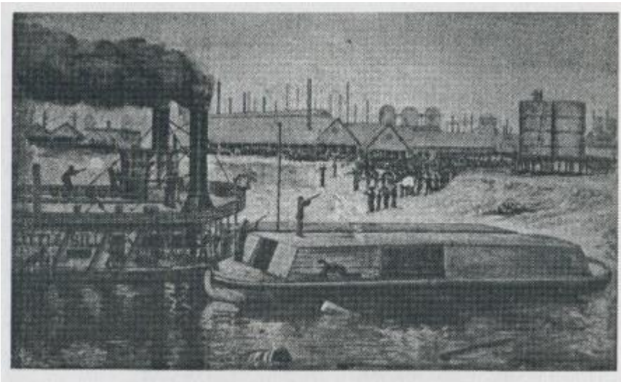
A "dark, angry mass of men." From Arthur Burgoyne, Homestead (1893), 64.