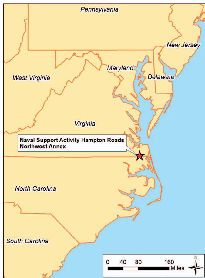
FIG. 1. Location of study site at Naval Support Activity Hampton Road, Northwest Annex in southeastern Virginia.

linensis ). To do so, we compared diet, determined through fecal analysis, to the frequency of ambush postures observed during the telemetric study of this population. In our study, a positive relationship between time spent in the vertical-tree ambush position and squirrel remains in snake feces would indicate squirrels are the target of the vertical-tree ambush position. Specifically, we assess the diet of our C. horridus population as it relates to foraging posture and relative prey abundance and biomass.