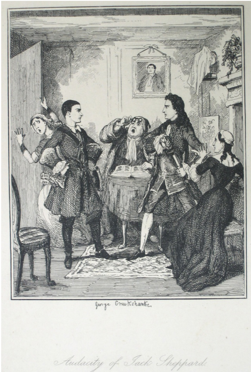
Fig. 5. "The Audacity of Jack Sheppard." Jack Sheppard (London, 1858; 109).