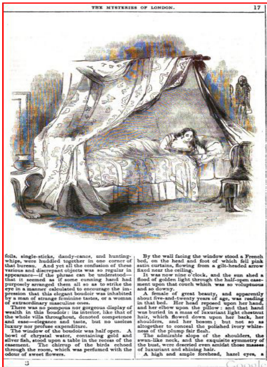
Fig. 3. Front page of installment three. The Mysteries of London (London, 1845; 17).