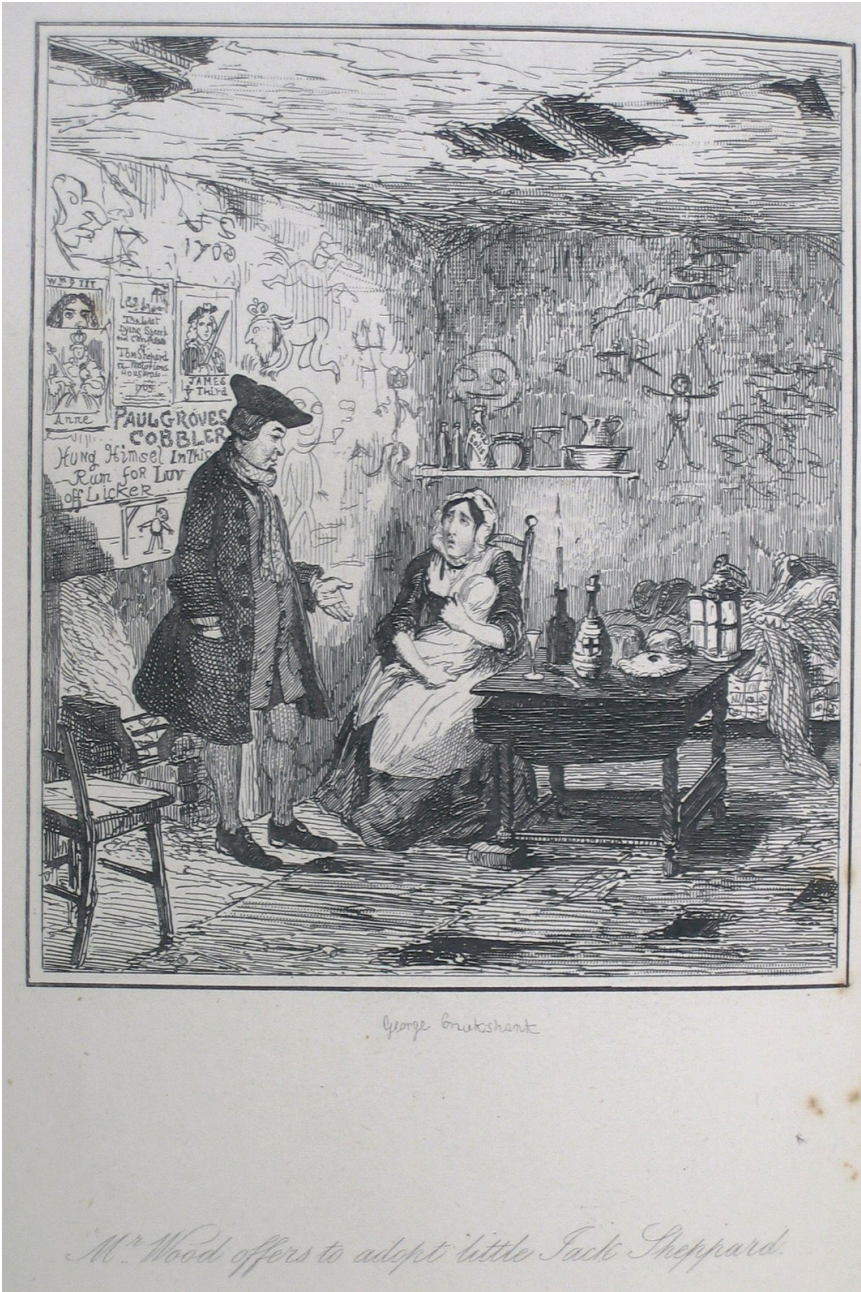
Fig. 1. "Mr. Wood offers to adopt little Jack Sheppard." Jack Sheppard (London, 1858; 1). 2