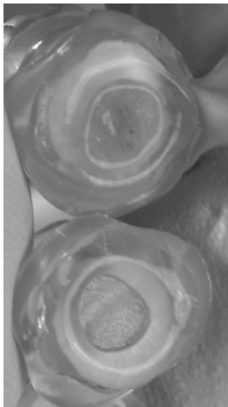
Figure 3 Rapid diagnostic test for Schistosoma haematobium (RDT-Sh) filters. Top filter is positive and bottom filter is negative.

78% (95% CI: 67–89%) specificity when the RDT-Sh is read at 1 min. The LCA reports sensitivities and specificities for urine microscopy, microscopic haematuria and proteinuria as 96% and 81%, 71% and 98%, and 46% and 89%, respectively (Table 3).