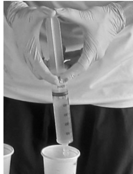
Figure 2 Filtering urine using the rapid diagnostic test for Schistosoma haematobium (RDT-Sh).

Within 60 s, most of the samples having S. haematobium eggs on microscopy were positive by the RDT-Sh and, for heavy infections, the RDT-Sh was usually instantly positive. The results are summarised in Table 1. The RDT-Sh was positive in 46% (6/13) of urine samples