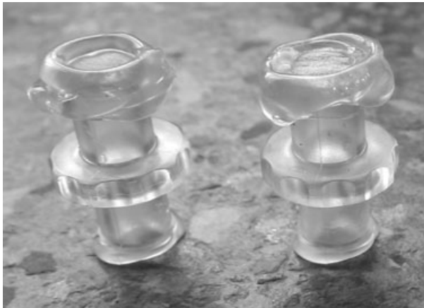
Figure 1 Rapid diagnostic test for Schistosoma haematobium (RDT-Sh) filters.

Up to 60 ml of urine (containing the anti-human IgG-conjugated antibody) was drawn up into a syringe and attached to the open end of the female luer lock coupling device (opposite to the end containing the glued filter paper) and the urine filtered (Figure 2). S. haematobium eggs remained trapped on the inner aspect of the filter paper. The empty 60-ml syringe was then removed. A syringe containing 3,3',5,5'-tetramethylbenzidine base (TMB) was then attached to the open female luer lock coupling device and approximately 0.25 ml of TMB was pushed through the filter. TMB turns from a pale yellow liquid to blue in the presence of horseradish peroxidase; therefore, the RDT-Sh was negative if the filter paper remained white and was considered positive if the filter paper turned blue (Figure 3). RDT-Sh filters that turned blue within 60 s were considered to be positive.