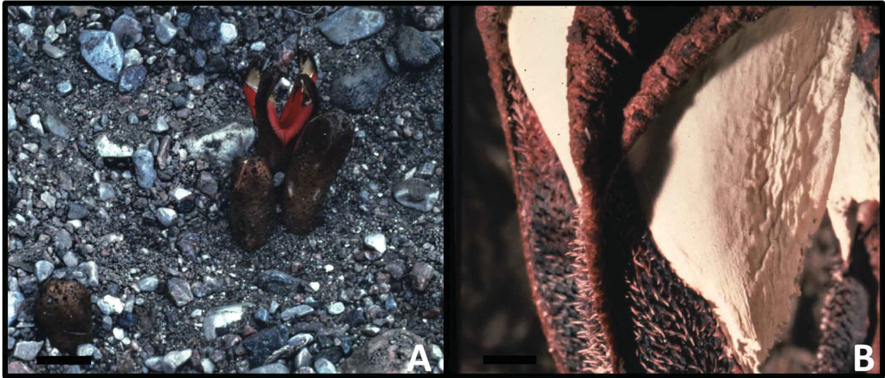
FIGURE 3: A) Photo of a H. abyssinica fresh open flower and open buds showing habit and bright red internal perianth coloration (Bar=4.0 cm) B) Close-up of apical osmophore (white) and dense strigose tepal margin setae. (Bar=0.5cm) both photographs taken by Anthony Miller, Sept. 1985 (Miller 7619, RBGE, ODU).

The ornamentation of the tepal lobe margins, meaning the surface of a tepal that touches the next tepal when in bud, has diagnostic value with herbarium material. Taxa in the section Euhydnora , H. africana , H. longicollis , and H. visseri , have longer bristles on the dorsal edge of the tepal lobe margin and consistently small setae. The section Tricephalohydnium represented only by H. triceps lack longer bristles on the tepal lobe margin and are ornamented with tiny setulae. The section Neohydnora that includes only H. esculenta has distinct ribbing on the tepal margins in addition to setae. In the section Dorhyna , H. sinandevu has glabrous tepal margins (Beentje & Luke 2002). Critically, H. arabica differs from H. abyssinica from East and Southern Africa by having very dense strigose setae (maximum 3.3 mm) that cover the entire tepal margin from ventral to dorsal edges, whereas setae from H. abyssinica typically have longer (maximum 7–11 mm) and more diffuse setae with remote setae apices (Fig. 4). When dense strigose setae are observed on some collections of H. abyssinica from East Africa they do not cover the entire sepal margin.