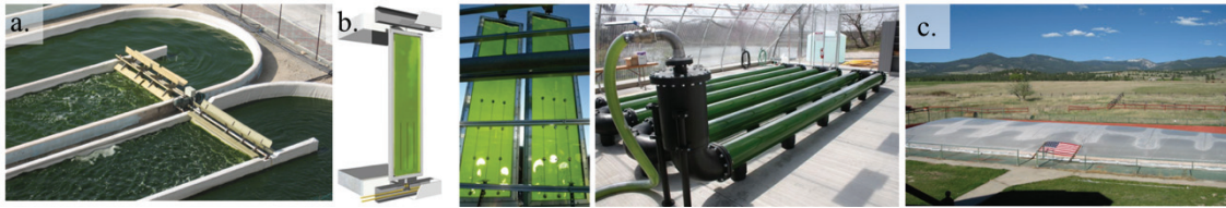
Fig. 1. a) open pond system; b) closed system of flat panels and tubular photobioreactors (PBR); c) hybrid algae production system

of contamination are much less. The downside of HAPS includes excess oxygen accumulation that inhibits algae growth and maintaining the constant flow of nutrients and gas exchange.