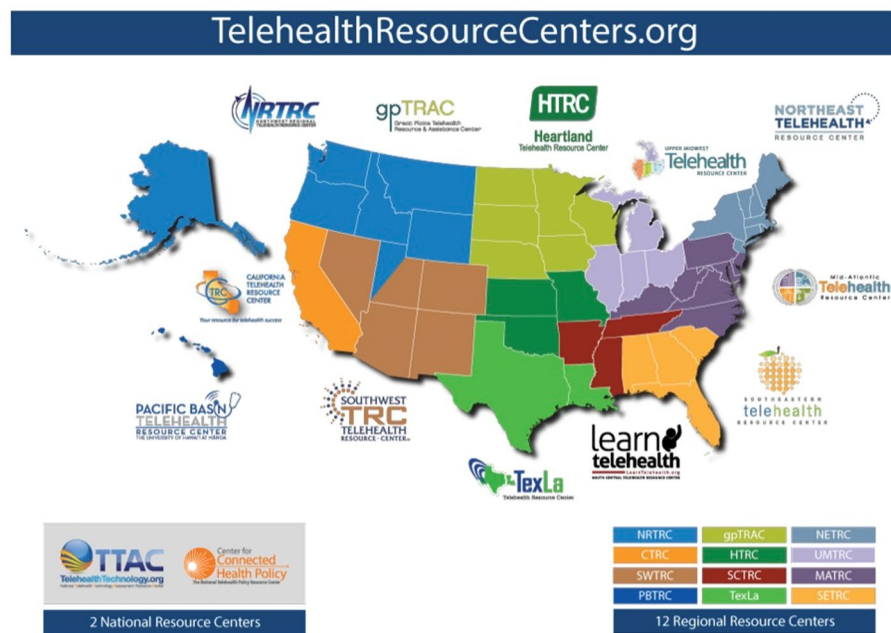
Figure 3 Telehealth Resource Centers in the US and Region Covered.

Note: Reproduced from Center for Connected Health Policy. The National Telehealth Policy Resource Center. The Federally Funded Telehealth Resource Centers. Available From: http://www.cchpca.org/sites/default/files/resources/PERSPECTIVES%20ARTICLE%20CCHP%20-Federally%20Funded%20TRCs%202014.pdf . Accessed May 15, 2017. 64