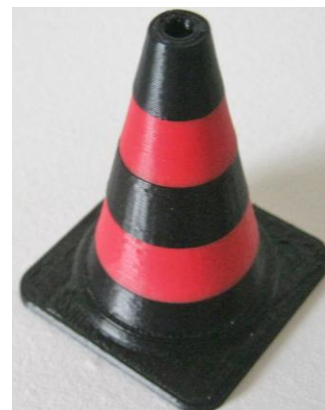
Figure 3. 3D Printed Object Using Additive Technology

In addition, all groups were asked to complete the MCT instrument 2 days prior to the completion of the sectional view drawing to identify level of visual ability and show