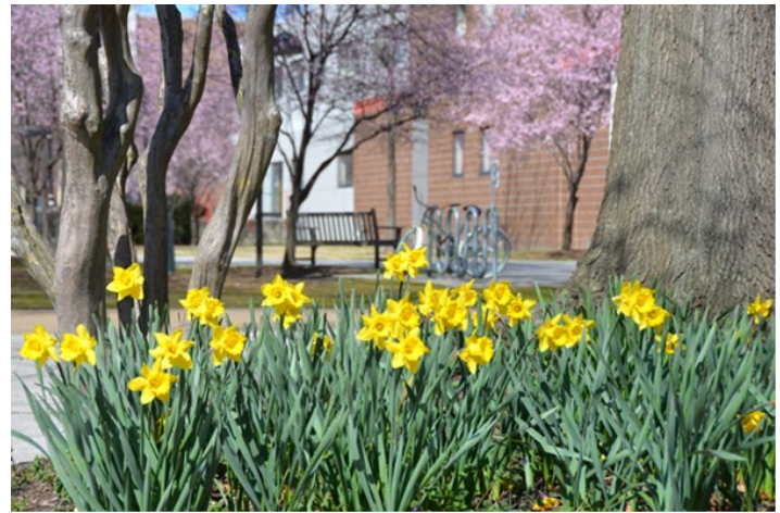
March 21, 2013