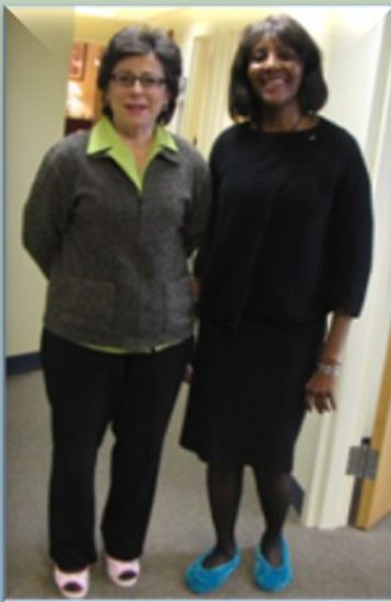
Slippers and Cider Day, February 27