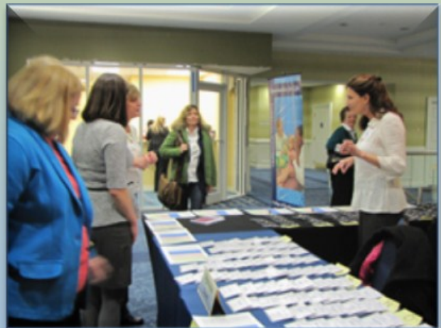
Dental Hygiene's Continuing Winter Education Weekend, February 22-24 at the Sheraton Oceanfront Hotel, Virginia Beach, VA attended by 242 participants.