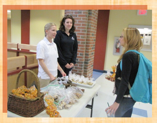
Student Nurses Association Bake Sale