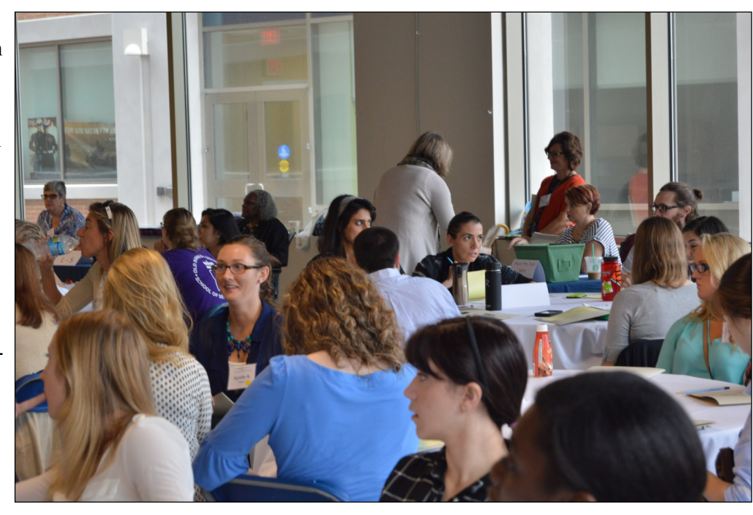
Students participate in an Interprofessional Education student learning activity in early November.

n Nov. 7, faculty and students from each of the five schools in the College of Health Sciences along with community volunteers participated in an Interprofessional Education (IPE) student learning activity. The creation of an IPE culture that prepares students for interprofessional collaboration and team-based health care is one goal that the college plans to achieve as part of the Strategic Plan for 2015-2020.