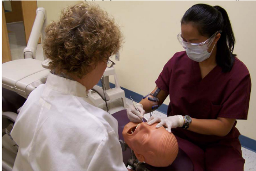
Figure 1. Surface Electromyography sensors attached to muscles while scaling

A sensor was placed on the pronator teres muscle as the examiner briefly palpated the proximal anterior forearm with the forearm partially flexed at the elbow joint and slightly pronated. The sensor was placed parallel to this muscle. Once the sensor was secured by tape, the MVIC was tested and recorded with the examiner applying forced resistance to the participant's clenched fist, resisting the twisting pressure from pronated to supinated position.