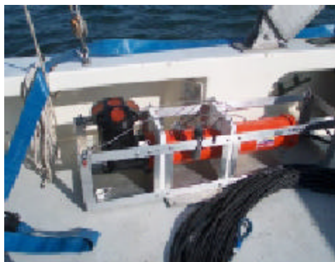
Figure 1. The Vertical Acoustic Doppler Current Profiler (VADCP) in its adjustable frame on board the R/V Arabella prior to deployment at LEO-15.

The first challenge we encountered was to design a way for the instrument to be easily deployed and safely left on the bottom for six months