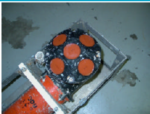
Figure 2. Top view of VADCP showing adjustable roll clamps (photo taken after recovery and pressure washing).

Having tackled the problems of getting the instrument in the water and getting it interfaced with the LEO-15 system, we were left with the problem of being able to remotely send it commands and to view and retrieve data.