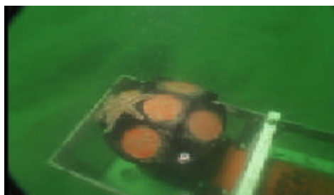
Figure 3. Biological interaction by mating starfish on VADCP.

Data collected by the ADCP were relayed along the LEO-15 cable back to the Rutgers Marine Field Station in Tuckerton and logged and displayed on a purpose-built computer we left connected to the field station's network. Since this machine had a "real world" IP address, we were able to communicate with it using a commercial remote control package for computers called Netop Remote©, which is less susceptible to break-ins by unauthorized users than other similar software packages. With this package installed, we were able to sit behind a workstation in Norfolk, VA and have full control over the logging computer in New Jersey. Later in the season, when Dr. Gargett was in Canada and I went on vacation, we were both able to use laptops to remotely control the installation and check data quality. Netop Remote© allowed scheduled batched downloads of VADCP data from the installation site to a workstation in Norfolk, VA on a daily basis. Without this critical piece of the puzzle, this project would have been impossible.