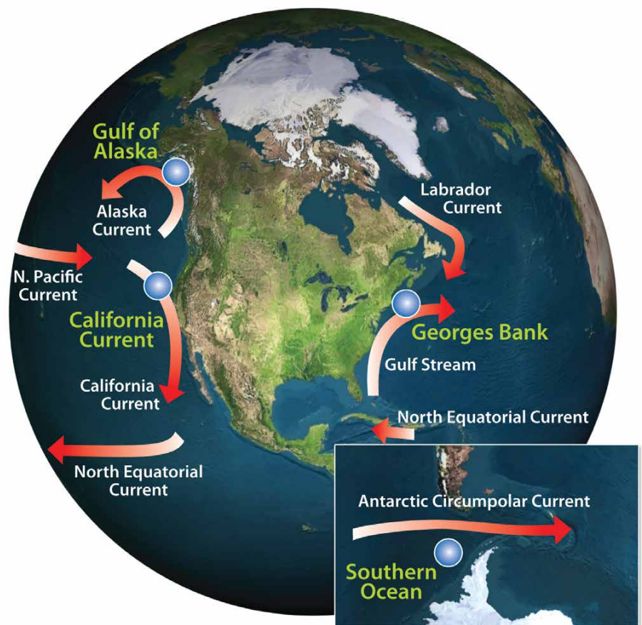
Figure 2. US GLOBEC study regions.

the entire program. The SSC provided general scientific oversight, tracked programmatic progress, developed implementation plans for regional programs and pan-regional synthesis, and liaised with funding agency representatives. Active engagement by the SSC stitched the regional programs together into a national program. It also allowed the program to adapt to financial setbacks, challenges in ship schedules, regional programs staggered in time, and a multitude of other trials. A central planning office for the US GLOBEC program provided strategic planning and program coordination, maintained records of publications, and supported a number of special reports and symposia (see http://www.usglobec.org ). The existence of a dedicated planning office