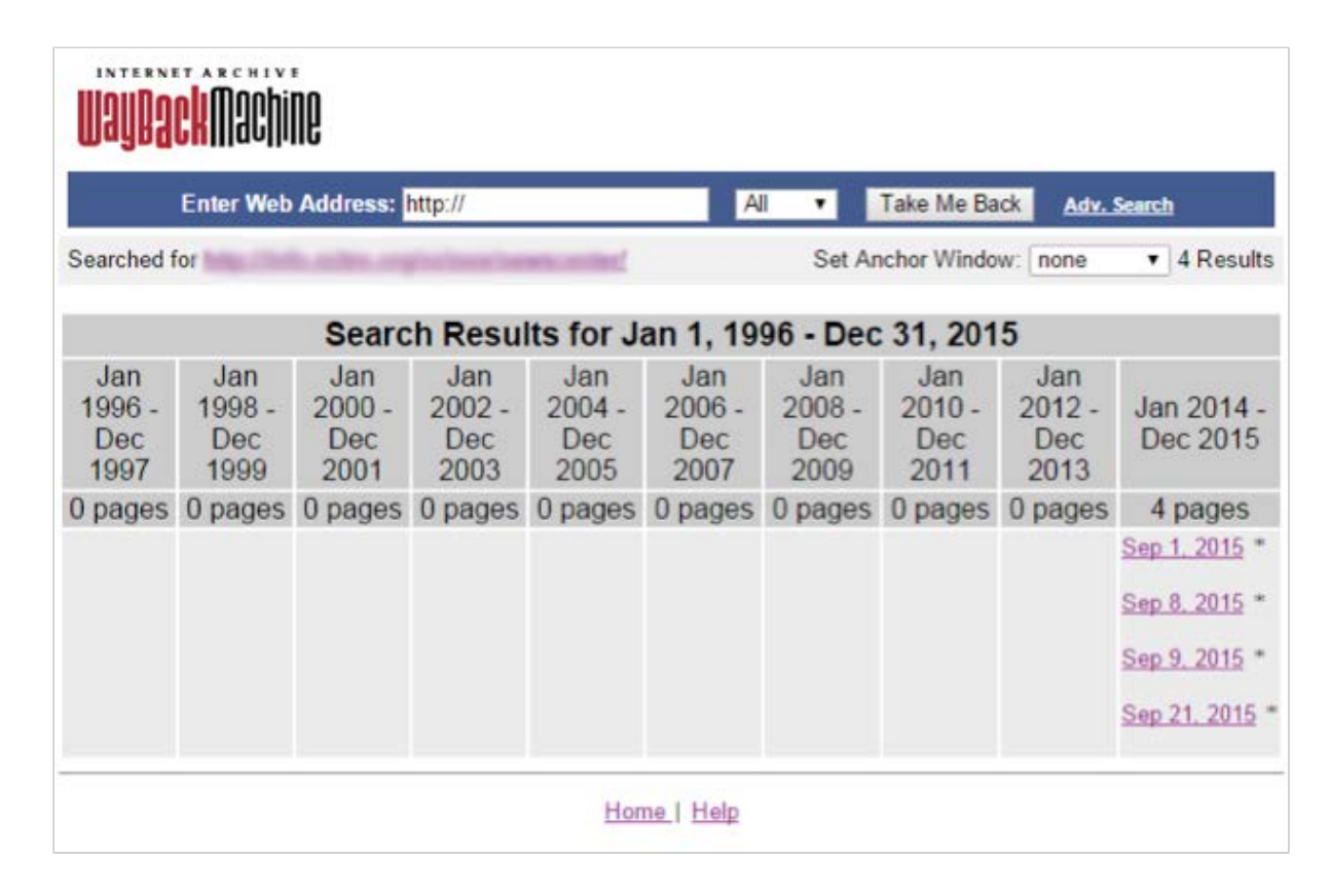
Figure 1: The MITRE Wayback Machine instance has four crawls from September 2015.

We performed four crawls of our target resources at four times in September 2015 (Figure 1). From these mementos, we can observe changes to corporate information resources over time, and even recall information from past mementos of the resources (Figure 2).