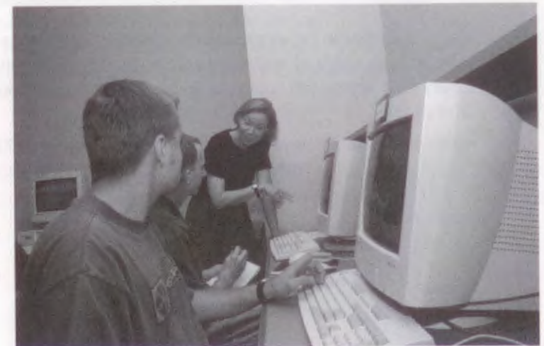
Information Technology Instruction Center, Perry Library, 1999

The Digital Services Center in the Perry Library also was instituted at the time of the move. This facility was designed to foster collaboration with individual faculty to integrate information technology resources and techniques into instruction. A full schedule of individual collaborative projects evolved, and the librarians associated with Digital Services presented an ever-growing list of workshops and seminars for faculty technology training.