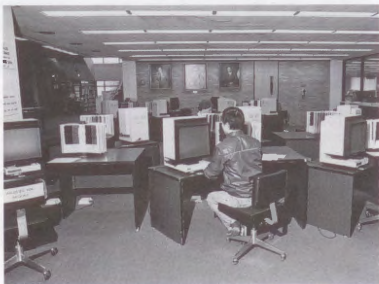
COMCAT Reading Stations, University Library, 1980

Old Dominion University Library's third automated system was selected and implemented during 1995, and INNOPAC by Innovative Interfaces Inc., was used. A well-regarded product with all major library functions automated,