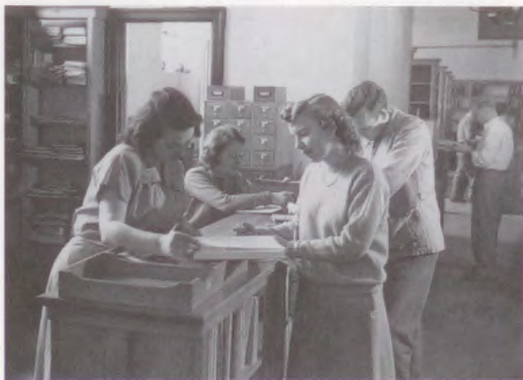
Library Service Desk, Administrative Building, 1952