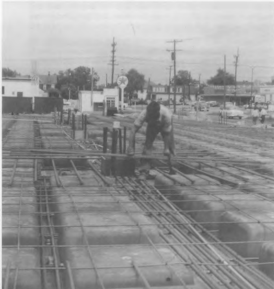
Construction under way on new Library Building located on north side of 48th Street, 1958.

new library, with the anticipated southward expansion of the campus. Pilings would be required in that location, though, and the appropriation did not include adequate funding for pilings to support the building. With advocacy from the Duckworth city administration, the college received the land as a donation from the city of Norfolk, as well as a $100,000 contribution to cover the cost of constructing pilings. Finally, the Norfolk Redevelopment and Housing Authority cleared substandard housing in the area to accommodate campus expansion.