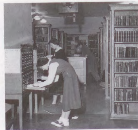
Library Stacks, Administrative Building, circa 1951–52

Administrative correspondence between Norfolk and the home campus in Williamsburg gives illuminating details of the early hardscrabble years of the Norfolk Division. The division was started with the understanding that all expenses would be covered by income from student fees; there was no commitment for a state appropriation or subsidy from the home campus. This financial arrangement was feasible while the division operated only from the