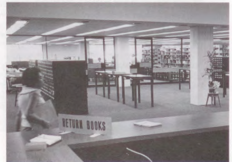
View from Circulation Desk, University Library, Late 1970's

Online bibliographic search services were introduced nationwide in the late 1970s, and the Old Dominion University Library was again in the forefront. Arrangements with the primary vendors of online bibliographic services (ORBIT and DIALOG) took place during 1978, with demonstrations for inter-