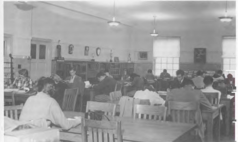
Library Reading Room, Administration Building, 1942

With the authorization of the college's Board of Visitors, an application for a loan and grant totaling $240,000 was made to the federal Public Works Administration during this time period. The plan was for the Norfolk Division to build a lecture/gymnasium building and a stadium with the funds, 30 percent of which would be a grant and the remainder a loan. The PWA provided $100,000 in a grant and loan for the construction of the new building and declined to support the construction of the stadium. Ground was broken for the building on May 31, 1935.