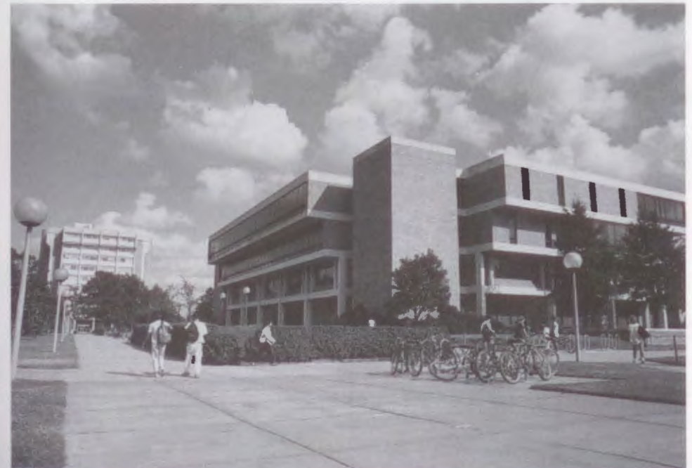
University Library Exterior, 1991