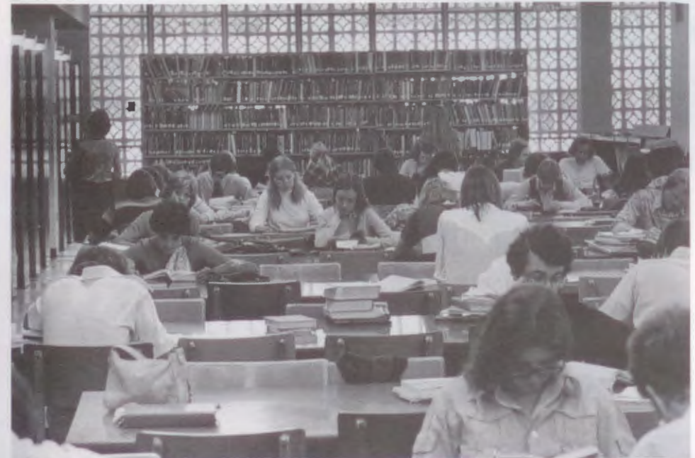
Reading Room, Hughes Library, 1975