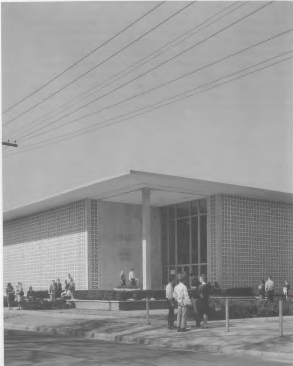
Hughes Library Exterior