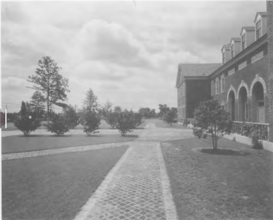
Looking south from Main Building, circa 1930s

When the Norfolk Division of the College of William and Mary opened in 1930, all facilities were housed in Larchmont School, a 1912 elementary school then unused. The library, in 1931 consisting of 200 books mostly donated by Norfolk residents, was housed in Room 18 of the school. This collection was characterized as "several shelves of books" and was judged so limited that professors would bring 25 or 30 books from their personal collections at the beginning of each semester to be placed in classrooms.