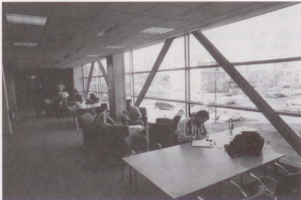
Library interior, 1990s

Whose News [library staff newsletter]. 1976–1979.