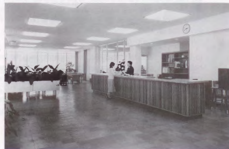
Circulation Desk, Hughes Library, 1959

Funding for the library collection was meager during much of the 1960s. In the 1964–1966 biennium, the Governor's budget contained an appropriation of only $100,000 for library books, periodicals and binding, an actual decrease from the amount spent in the previous biennium. The Virginia Higher Education Study Commission's staff report, published in 1965, noted that Virginia academic libraries did not regularly receive annual increases in acquisitions funds to keep pace with scholarly needs and recommended that the state's practice be altered in this regard. Later, when the self-study for the 1972 Southern Association reaccreditation was prepared, the collection consisted of about 200,000 volumes, weighted disproportionately toward journals, with too few books. During the 1966–67 academic year, the first ac-