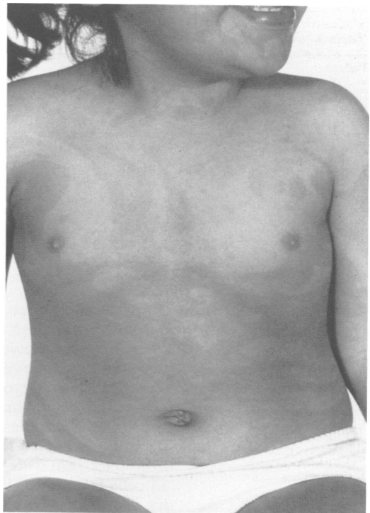
Figure 1 Hypopigmented streaks on the anterior trunk of case 1.

These fibroblast karyotypes are summarised in table 2.