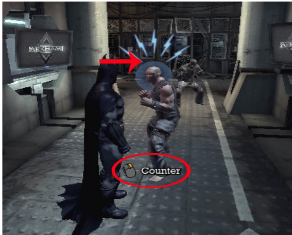
Figure 3. Cue of how to use the counter action (Batman Arkham Asylum, 2011).

visual reminder of the combination on the screen to remind the player of the technique in question. Initially these are in the form of pop up instructions like, “Use ‘W’ to move forward” that prompt the player to master movement controls and later special detective and combination moves that add options to playing the Batman character. In addition, these pop-up cues direct the players attention to the in-game badge system, ‘Riddler trophies’ (exploration rewards), and optional goals the player can choose if they appeal to their play/learning style.