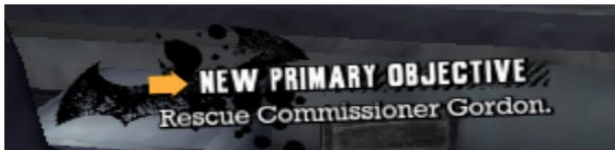
Figure 2. Player was given a new objective to rescue Commissioner Gordon (Batman Arkham Asylum, 2011).

Batman also uses pop up cues (Figure 3) to help guide the player with non-narrative objectives, like learning the controls of the game. Developing facility with game controls and mapping them to gameplay is an implicit learning objective. When a specific combination is needed to pass an obstacle, the game uses a