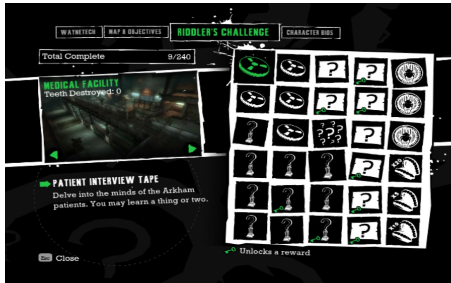
Figure 7. Achievement and award assessment in Batman (Batman Arkham Asylum, 2011).

when we entered the game space and would briefly leave the space for new goals when challenges were completed in-game.