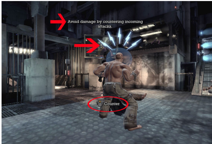
Figure 4. Pop-up instructional design in Batman (Batman Arkham Asylum, 2011).

instance, when tracking a bullet shot at Batman, he may say to himself that he should look for clues by using detective mode. This method of presentation is shown in concert with a pop-up showing what button to press for detective mode – or a scanning function the character uses to find clues. Often, the non-player character Oracle describes how the method can be utilized to follow trails that will allow Batman to track certain non-player characters. Oracle is in radio communication with Batman throughout the game, but is used primarily when new lessons are being introduced, and the player can listen in on a directive conversation. Stories have been suggested to provide a uniquely appropriate method for relating content with one's cognitive structure (Schank, 1995). Batman utilizes a story trope to provide context to the game. Game dialogue is used to inform the learner of stimulus material.