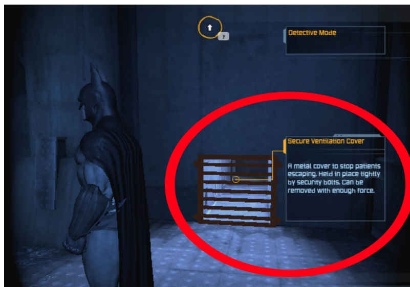
Figure 5. Detective mode learner guidance in Batman (Batman Arkham Asylum, 2011).

The second presentation type in Batman: Arkham Asylum is a just-in-time style of instruction that shows the keyboard and mouse combinations for a specific action that can be taken by the player as Batman. As noted above, these instructions pop up on the screen as certain movements became possible for the player to perform, as evidenced in Figure 4. The player is expected to use the combinations and to access the skill listed. This allows the player to do what the player was told at the top of the screen. This general presentation style is used in instructing the player to navigate combat and detective sequences, but is not a separate tutorial or instructional design, it is embedded in the play of the actual game.