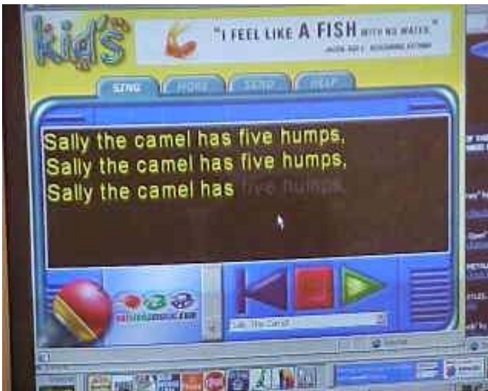
Nursery Rhyme displayed on monitor with high-lighted phrase in the last line “five humps”