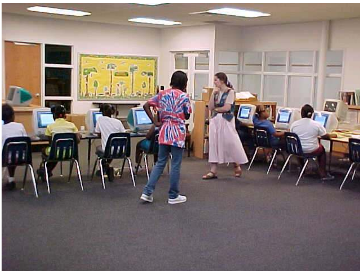
Children in the Summer Camp using Karaoke in the computer lab