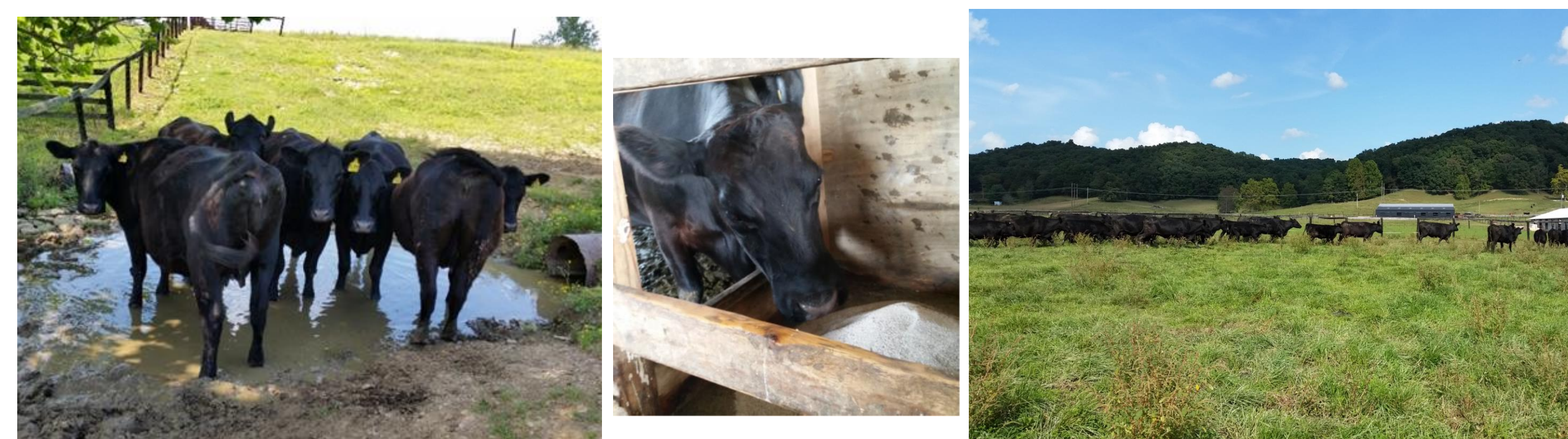
Figure 1. Effects of hydrolyzed yeast mineral on cow behavior.