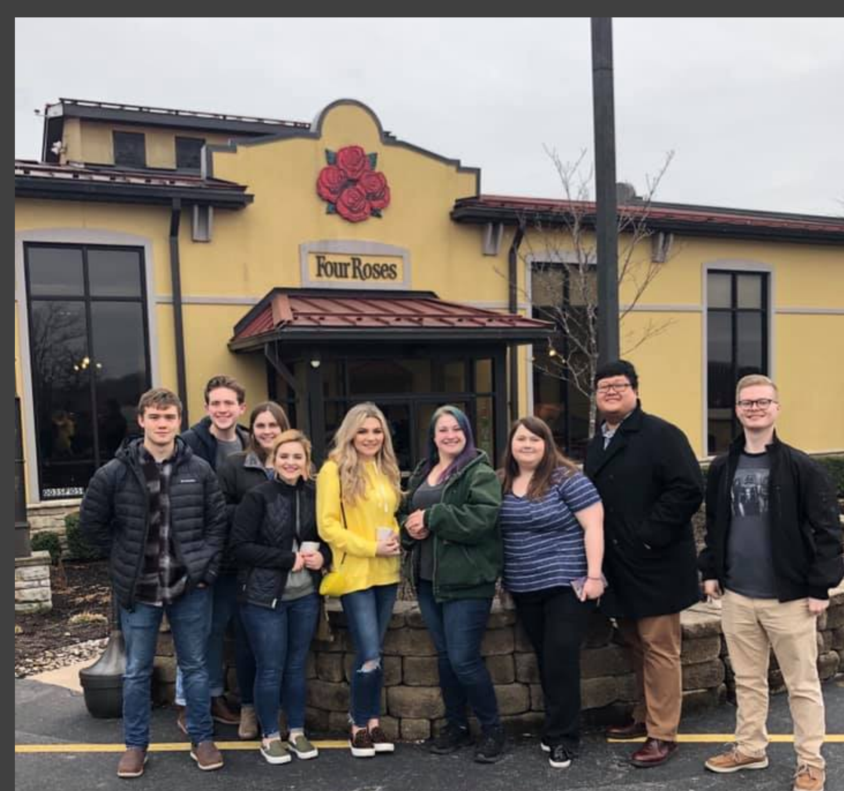
Members toured the Four Roses Bourbon Distillery and learned about the fermentation and distillation process