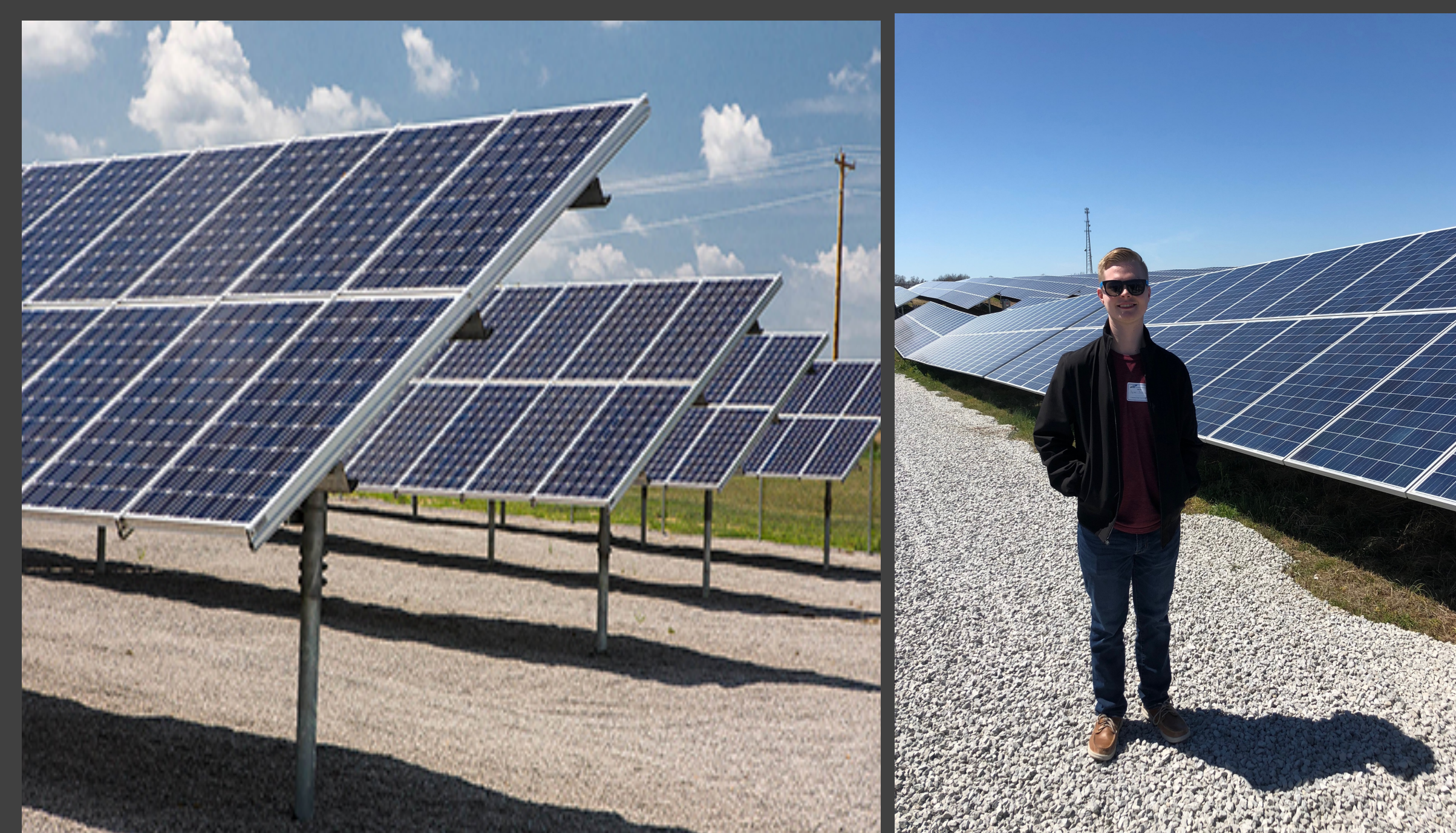
Members toured a solar farm and learned about how solar panels work to generate electricity