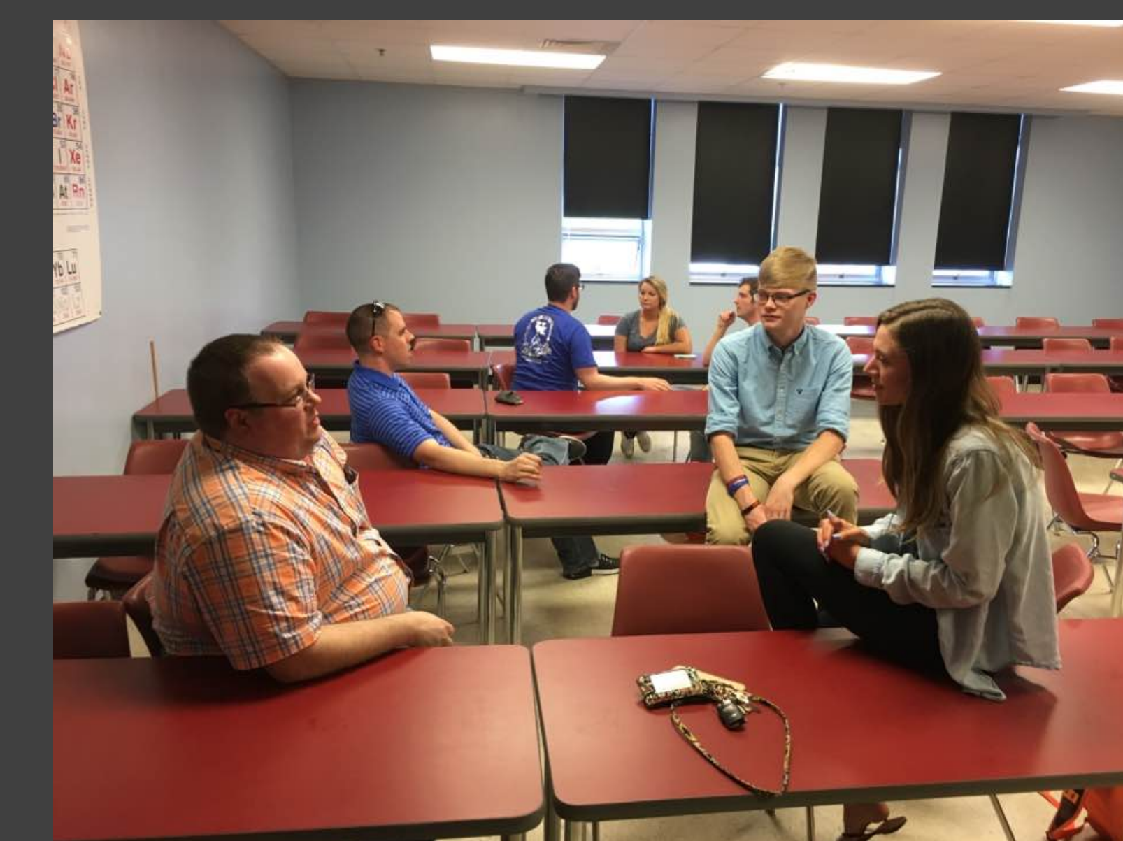
Alumni visit to discuss with young Chemistry and Biology majors about their future careers