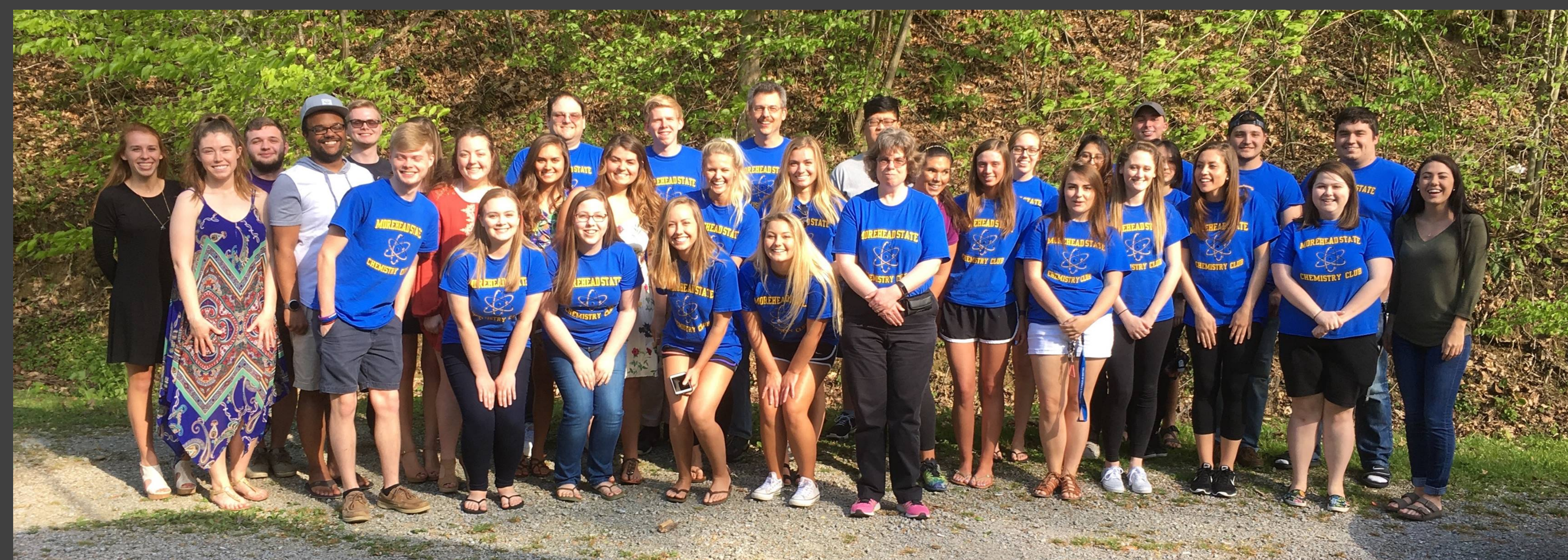
Annual Spring Picnic 2018