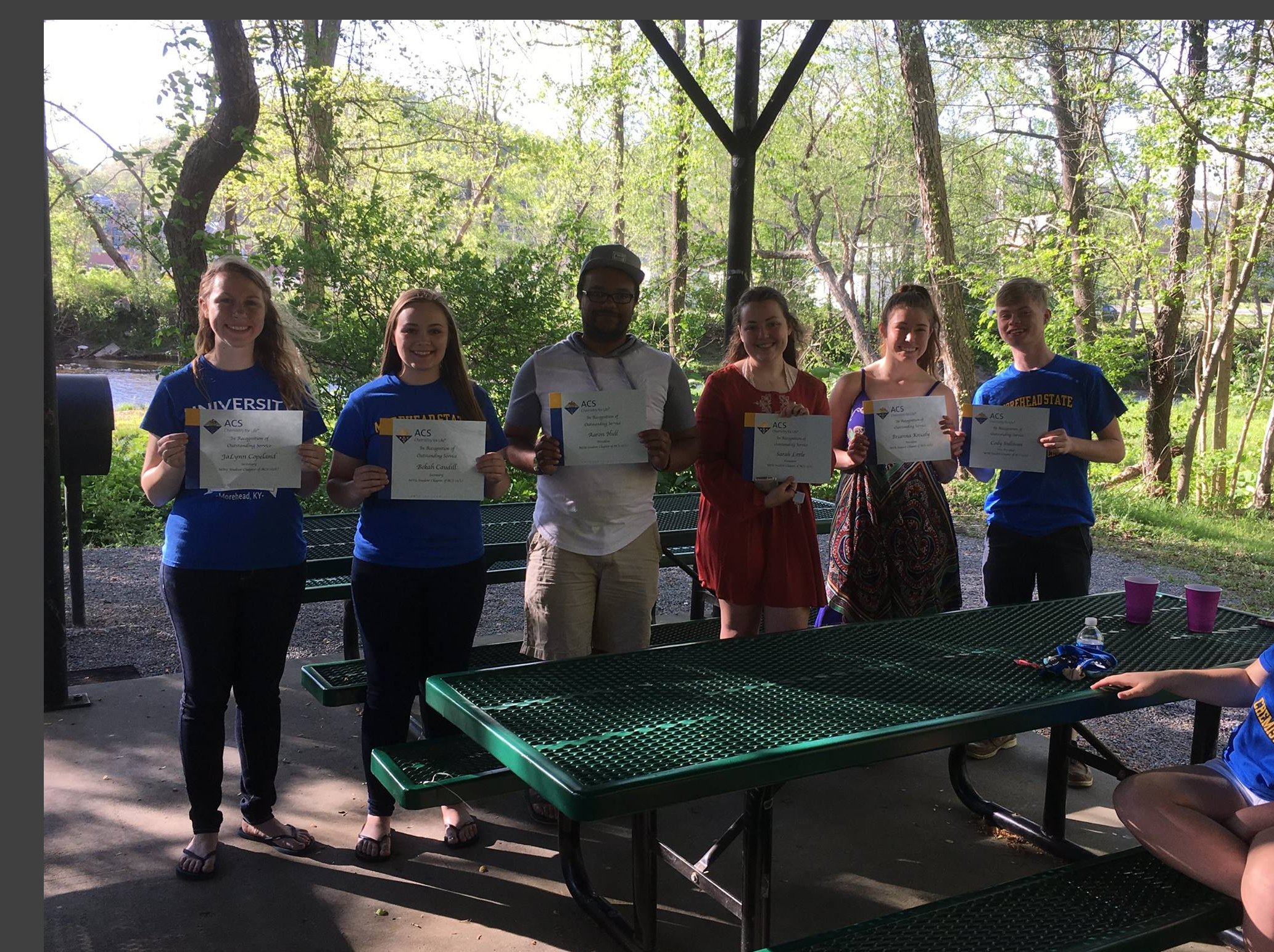
Officers were presented awards last year for their hard work and dedication to the Morehead State Chapter of ACS