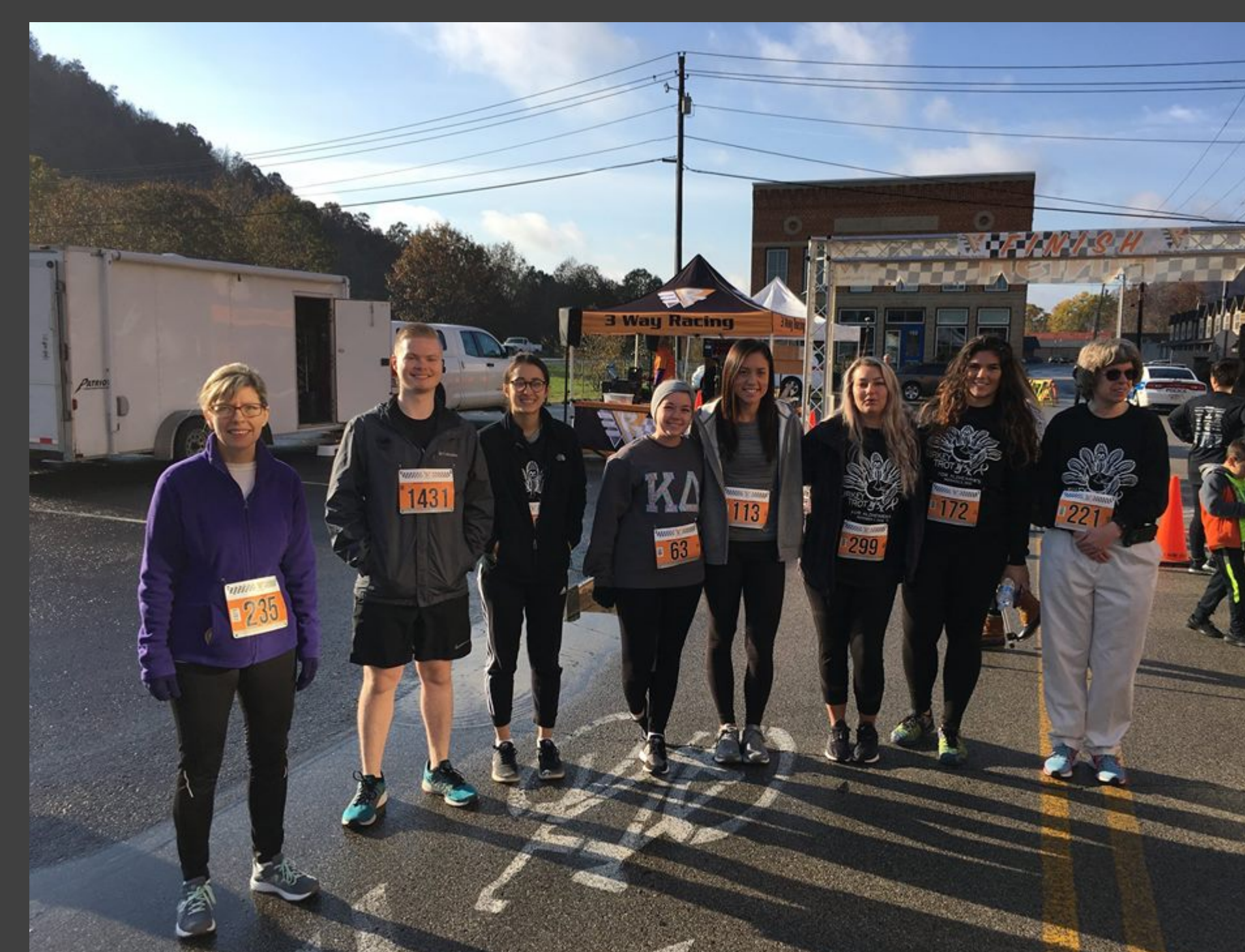
Members participated in a 5K race to raise awareness and money for Alzheimer's research.