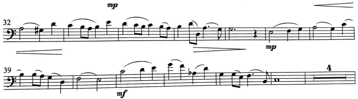
Figure 11. Barbara York's "Four Paintings by Grant Wood," Movement 4, lyrical section