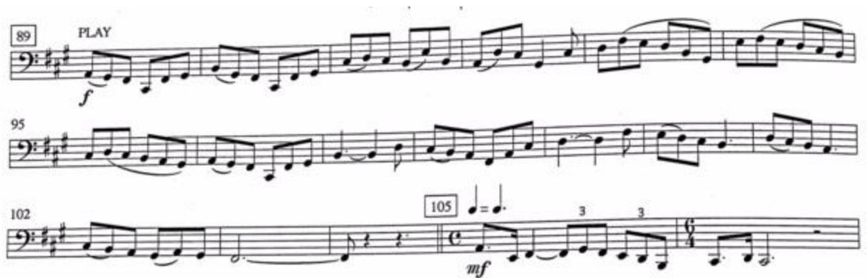
Figure 5. Neal Corwell's "New England Reveries," measures 89 through 106

A specific area to consider when preparing this piece is the quick and more technical section (measures 89-105; see figure 5). For the f tuba – bass tuba – this section is in the lower register of the horn and the fingerings are a bit awkward with the frequent use of the ring and pinky fingers. Also, there are not a lot of opportunities for breathing in this section so it is important to consider phrasing when planning breaths. Another consideration is the recapitulation of the opening section (measures 151-175). This section repeats much of the material of the beginning and the rhythms are relatively more complex. It is imperative to be in sync with the recorded accompaniment in this section, as well as throughout the whole work.