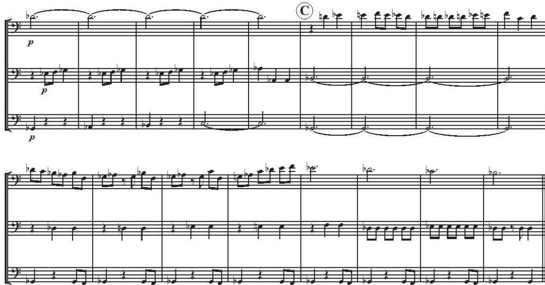
Figure 8. Allen Parrish's "Fatal Floral Trio for Tuba," Movement 2, Rehearsal Bar "C"

"Vorax Tupenthes" – the third movement – is based off of a rhythmic ostinato which is heard immediately at measure 1 in lower tuba part. The title is derived from "Vorax Nupenthes," which is the scientific name for the pitcher plant. Nupenthes was changed to "Tupenthes" so that the title would roughly translate to "The Devouring Tuba Plant." This ostinato is passed around several times and even broken up between the voices five measures after rehearsal "B." This was probably the biggest challenge in the whole work – practicing the emphasis of the individual voice's piece of the rhythmic ostinato.