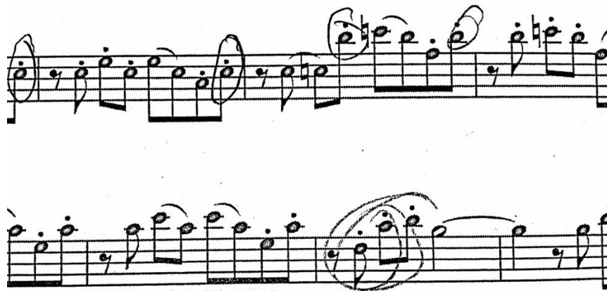
Figure 9. Barbara York's "Four Paintings by Grant Wood," Movement 1, opening

Movement one, "Stone City, Iowa" presented primarily technical considerations, although the middle section was much more lyrical and had a higher tessitura. The greatest challenge when preparing this movement was the frequent, unusual intervals. An example being found in measure 7, which is an E3 to a Db4 (see the second measure of figure 9). It was helpful that much of these leaps were repeated throughout the piece without much variation. Other than the wide leaps, the higher tessitura was a challenge through the movement. The first movement had a range from D2 (below the staff) to F4 (above the staff). Another consideration in this movement was the contrast between the opening section (measures 1 through 40) and the middle lyrical section (measures 41 through 58). It was important to practice a change in mood between the different sections.