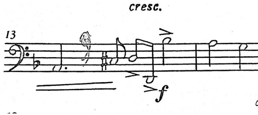
Figure 6. Alexej Lebedev's "Concerto Allegro," measures 13 and 14

octave, which can be found in measures 9, 11, 19, and 33 among others. Another technical challenge are the sixteenth note rhythms such as those in measures 9, 12, and 25.