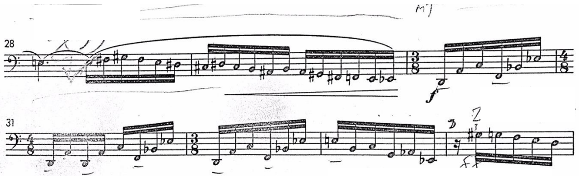
Figure 2. Anthony Plog's "Three Miniatures," Movement 1, measures 28 through 34

The second middle section (measures 46 through 62) has different considerations than the previous sections. This section is, dynamically, the softest which would create difficulties in sound projection. Also, the rhythms are different than any other in this movement and a feeling of being in single meter (rather than in mixed meter or six) is created. There is great opportunity to be musical with this section in the rising and falling of the melodic line.