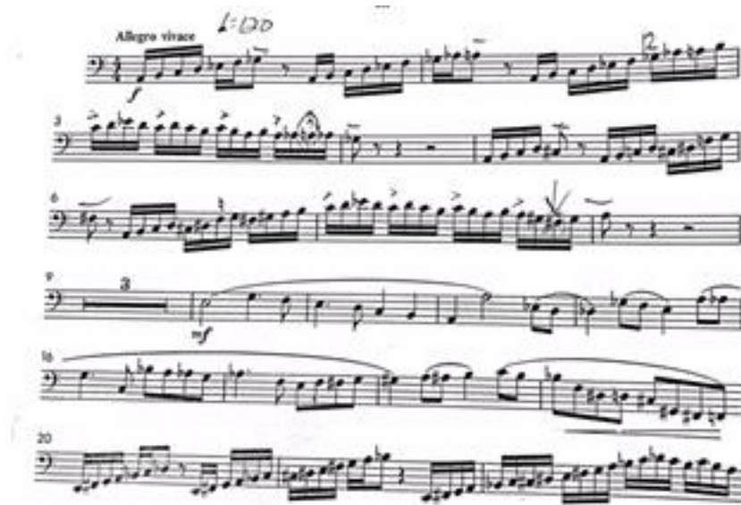
Figure 4. Anthony Plog's "Three Miniatures," Movement 3, measures 1 through 22

latter should be played staccato. Another contrasted section is from measures 23 through 39 and the performer must consider the syncopated rhythms as well as the variety of wide intervals. The final section of this work is at an even brisker tempo, although it is slurred rather than articulated. It is important for the musician to build momentum until the very end.