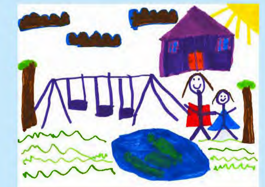
Haldeman Community Center Calendar, the individual month of June.