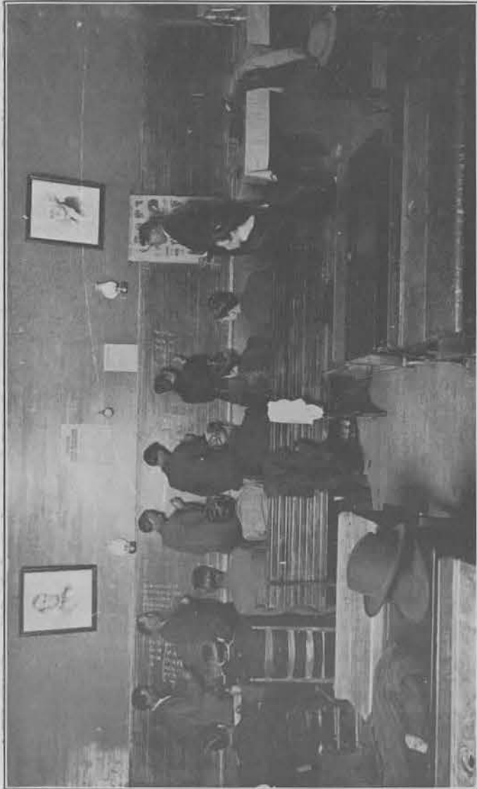
Arithmetic was a popular study.