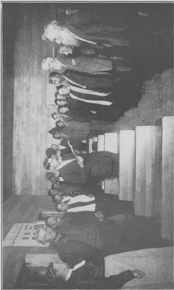
The spelling match.

Writing —The beginner's class had to write all of the script copies and letters in Country Life Reader, First Book , and to write legible letters in correct form, address envelopes, write checks and write paragraphs from dictation. Special attention was given to making the signature legible.