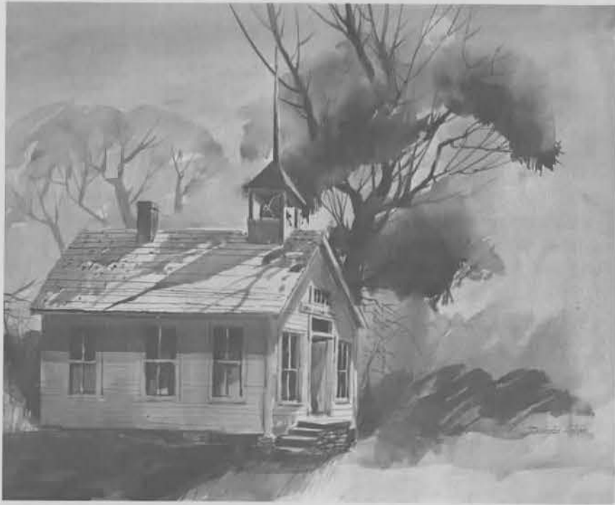
The Cora Wilson Stewart Moonlight School