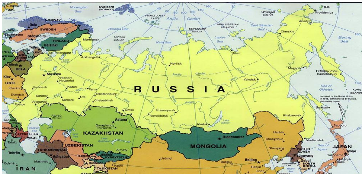
Figure 1: Russia: Political Map 174

Below you will find a map depicting Russia and its neighboring countries.