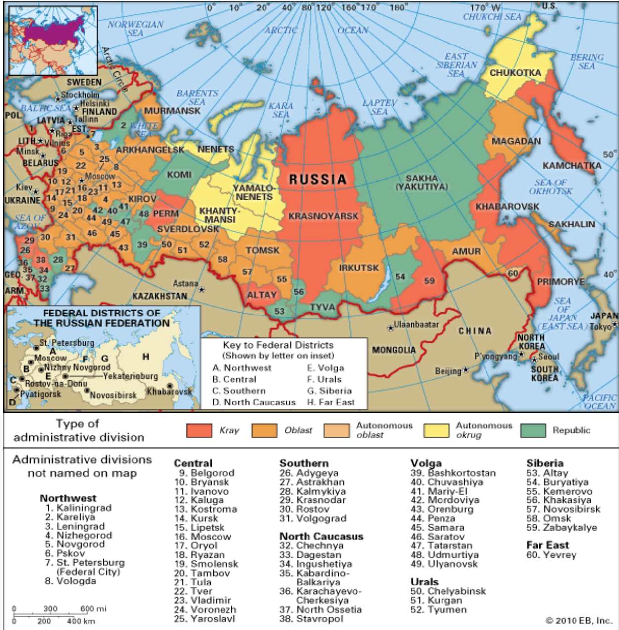
Figure 5: Federal Districts of the Russian Federation

The current Russian Constitution was adopted on December 12, 1993. 232 The country has a civil law system with judicial review of legislative acts. 233 The government is comprised of three branches: executive, legislative, and judicial. The Executive Branch is led by a