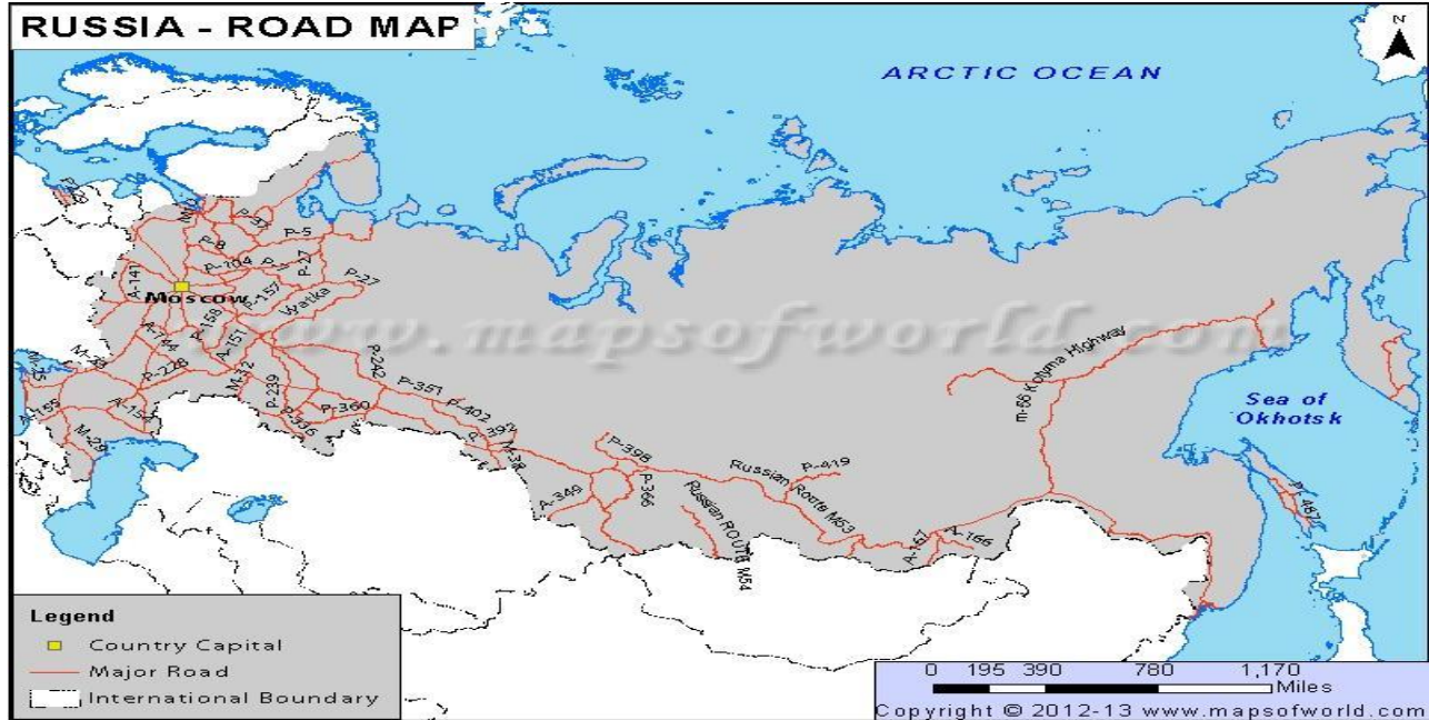
Figure 4: Russia Roadway Map 224