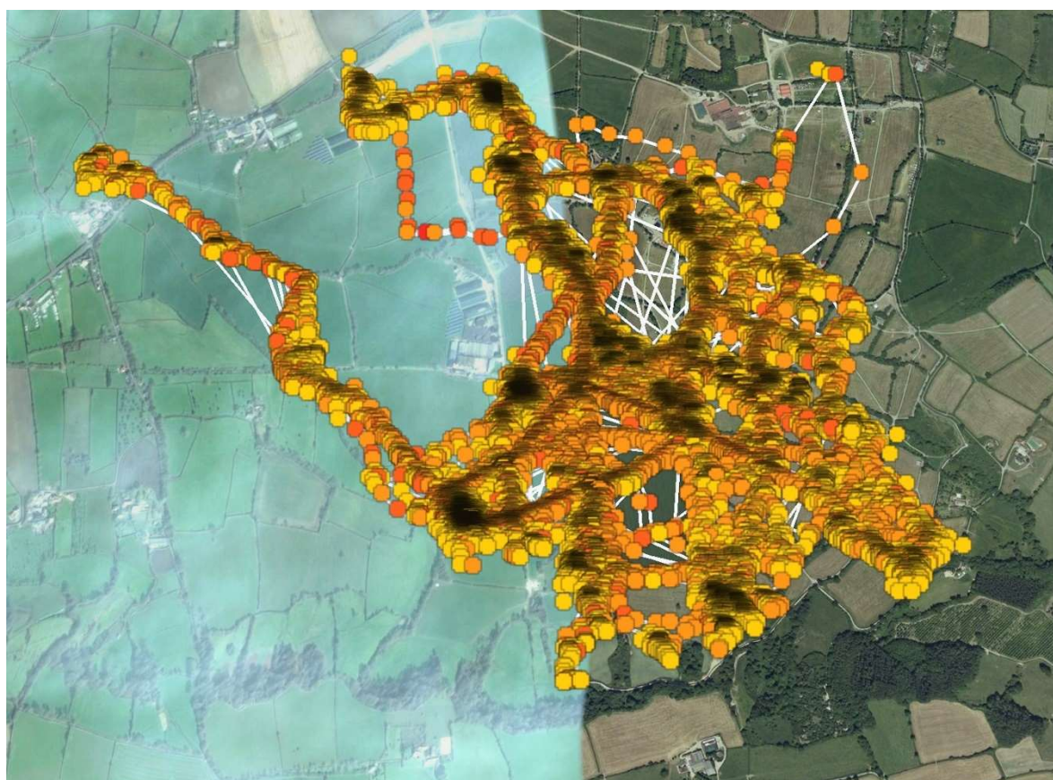
Figure 1. Location of physical activity intensities for all participants around the festival site. Circle colour indication: Yellow = Light; Orange = Moderate; Red = Vigorous. (Dark areas indicate increased density of physical activity; white lines represent additional movement pathways with minimal physical activity registered).

* Moderate to vigorous physical activity (sedentary 0–99 counts \cdot min ^{-1} , light 100–2689 counts \cdot min ^{-1} , moderate 2690–6166 counts \cdot min ^{-1} , vigorous 6167–9642 counts \cdot min ^{-1} and very vigorous \geq 9643 counts \cdot min ^{-1} ) Sasaki et al. [16].