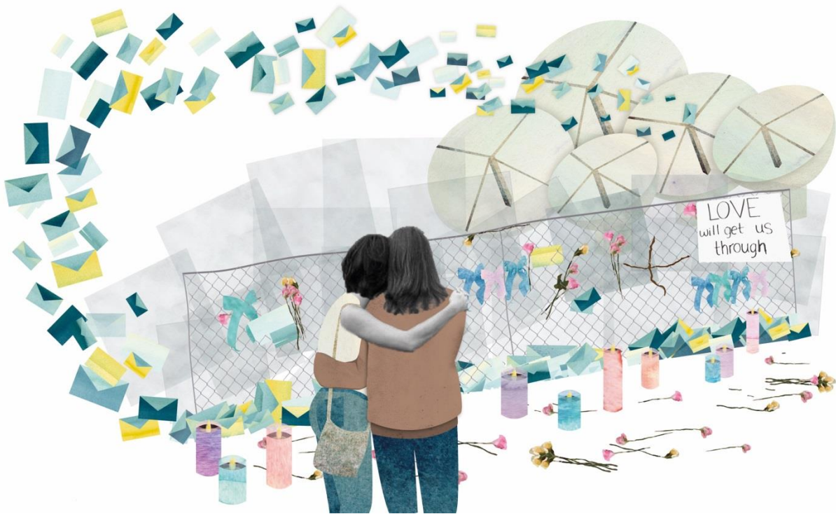
Figure 2. The flood of letters and messages following tragedy—illustration by Rebecca Mullen from The Story of the Stuff .