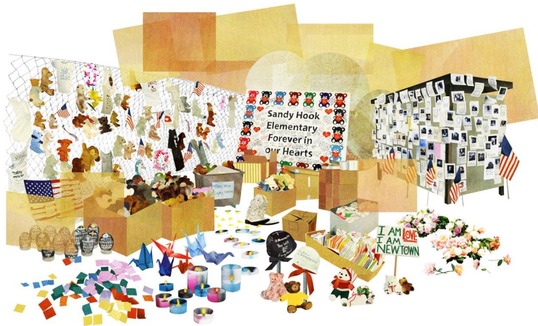
Figure 5: Illustration by Natsko Seki from The Story of the Stuff depicting items left at the sites of Oklahoma City, 9/11, Texas A&M, Virginia Tech, and Sandy Hook.