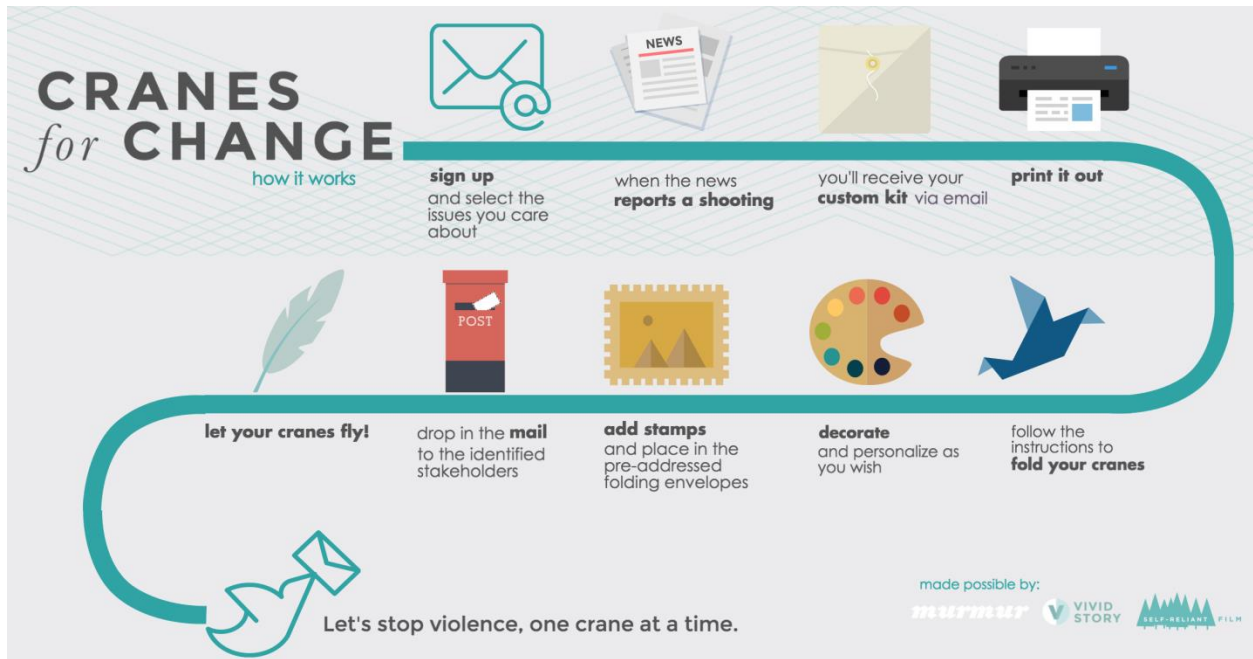
Figure 7: An infographic that explains how the Cranes for Change app worked.