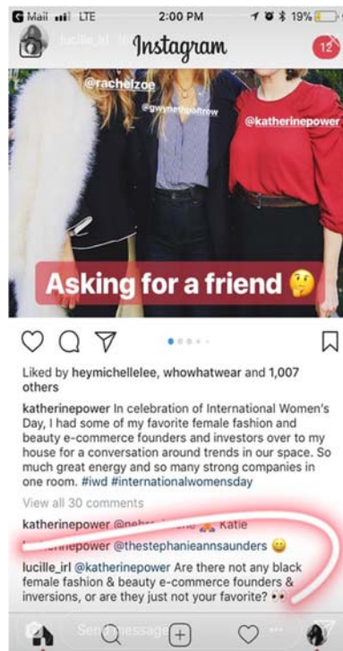
Figure 15. A screen shot of Lucille’s Instagram Story calling attention to the lack of non-white bodies in @katherinepower’s original post.