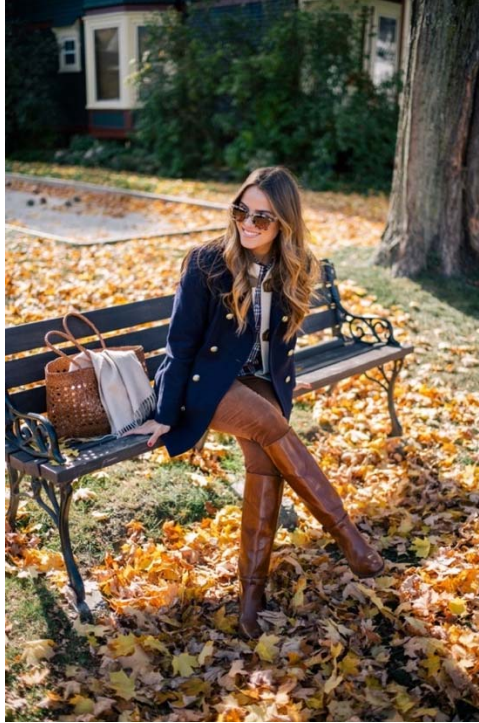
Figure 1. “Riding Boots for Fall,” by Gal Meets Glam , features idyllic images of her enjoying a vacation in the Vermont countryside.