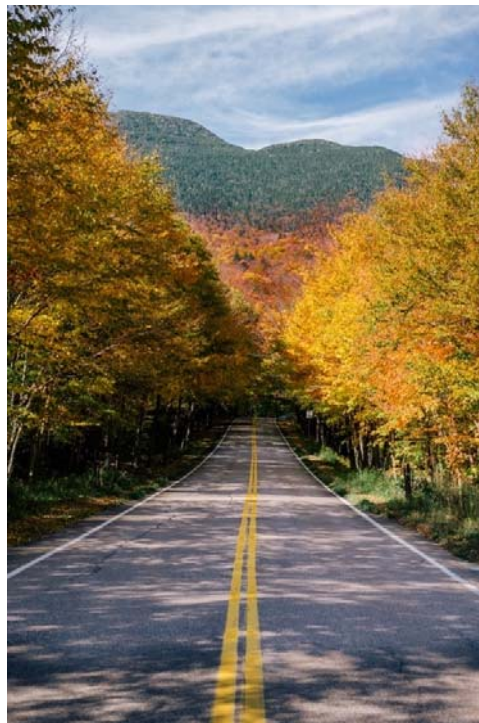
Figure 2. “Riding Boots for Fall” also features photographs of the rolling autumn hills and changing leaves (Engel, 2016b).