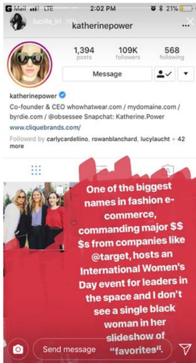
Figure 14. A screen shot of @katherinepower’s “International Women’s Day” post.