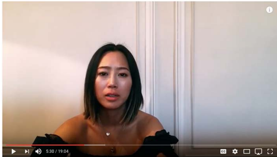
Paris Vlog - Haute Couture Fashion Week and Real Talk | Aimee Song

Figure 17. A screen shot from Song of Style 's confessional vlog detailing her experience with depression and her struggles with always presenting the happy blogger image (Song, 2017).