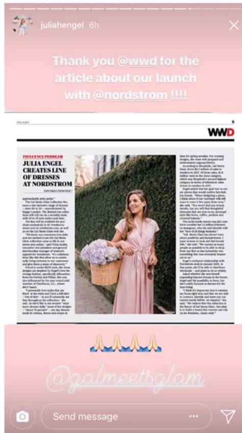
Figure 13. A screen shot of Gal Meets Glam 's Instagram Story highlighting the feature on her clothing collection to Women's Wear Daily , also thanking the publication (Engel, 2018c).

Through a continued combination of affective, relational, and communicative labor, Engel keeps her blog followers engaged. The blogging phenomenon is interactive, especially with Instagram Stories. Users can send Engel a direct message about a particular Story or like comments to her posts. Engel can respond to user messages or acknowledge her followers through a Story proclaiming “thank you” or a heartfelt Instagram caption. By responding and acknowledging her follower base, Engel continues cultivating and maintaining her affective and relational connections. These connections propel her blog forward. Gal Meets Glam 's transmission of affect illustrates Song & Zinkhan's (2008) findings that bloggers who provide personalized information increase