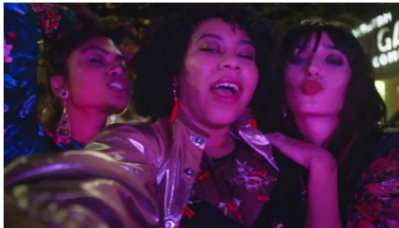
Figure 19. Later in the commercial, three women ride in a convertible snapping selfies (eBay, 2018).

This commercial pinpoints the current state of fashion and lifestyle blog culture: simple blog journals about fashion and style with unprofessional photography and unedited content are practically nonexistent. Instead, blogs have become curated feeds of aspirational imagery whose primary function is to encourage women to be can-do girl subjects. Specifically, blogs frame the can-do girl subject as a happy, empowered, entrepreneurial woman who consumes pretty things.