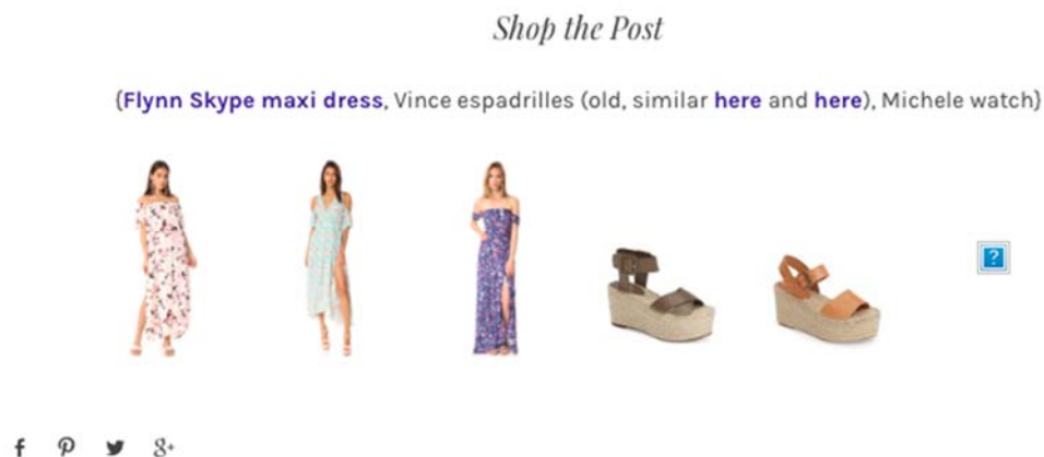
Figure 4. A screen shot of the "Shop the Post" feature on The Middle Closet website, accompanying the "Back to Monday" blog entry (Middleton & Kushner, 2017b).

Hailey's narrative featured musings on the difficulty of Mondays and a discussion of her weekend attending a "barn party" at the Denver polo grounds. She explained the excitement of meeting new people and getting out of her standard routine followed by a discussion of the merit of maxi dresses. Underneath the narrative was a section titled "Shop the Post":