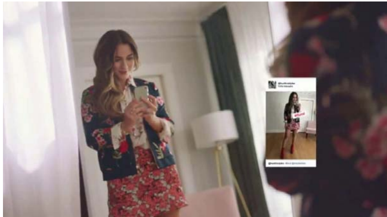
Figure 18. The first model in the eBay fashion commercial, who starts the consumption process by posting an Instagram photo tagged #floral (eBay, 2018).