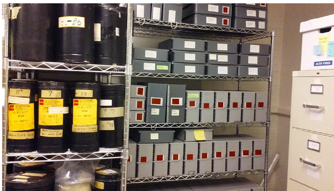
Fig. 3. Just a portion of the archive. The film canisters at left include tens of thousands of aerial sea ice imagery taken by the U.S. Navy in their 1960s “Birds Eye” project. These are the only existing copies.

of photography, exploration, or the role of women or minorities in these areas.