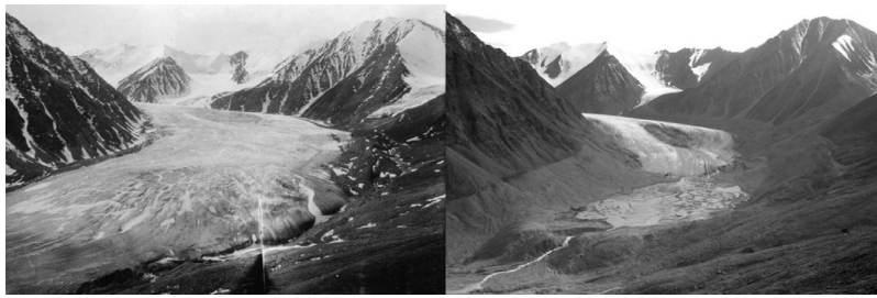
Fig. 1. Images of Okpilak Glacier, Alaska. On the left: 1907 [16]. On the right, 2004 [17].

been used in other scientific endeavors, popular television documentaries, artist books, text books, and even children's books [15].