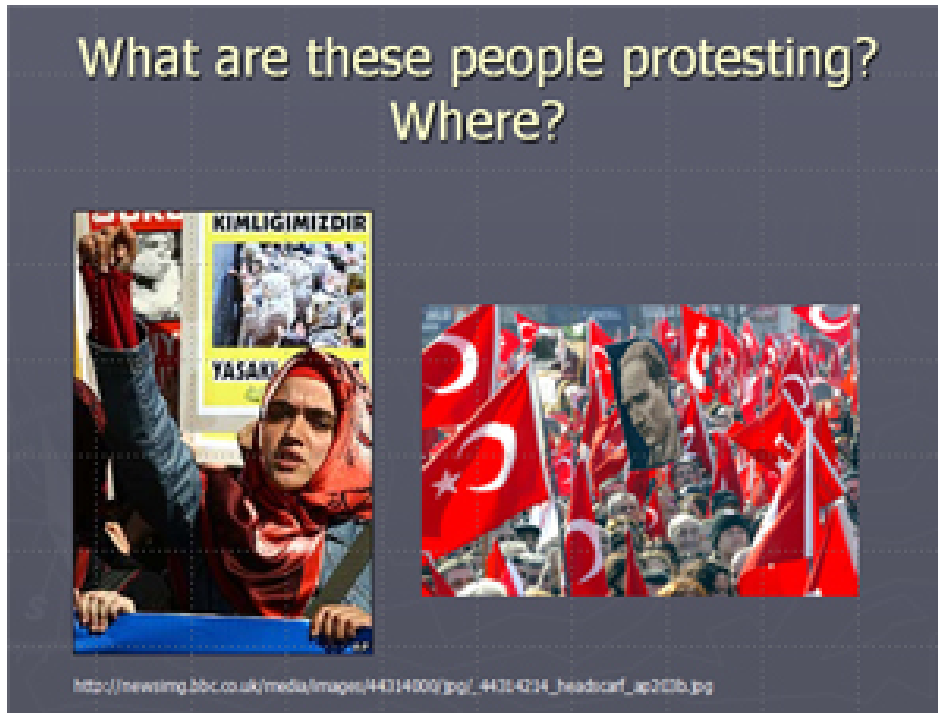
Figure 4. Slide used to discuss the controversy of head covering in Turkey.

For assignments, students had to write six short two-to-three-page essays, responding to class readings and other materials, including images and videos. For the first assignment, for example, students had to view a 20-minute video on the Cofan tribe and read two BBC articles on oil drilling in Ecuador. The video had an emotional impact on students, which was evident in the class discussion. In the questionnaire, students reported that they used videos and news articles for writing essays and found them useful. The TA grading the essays noticed that “the video had the largest impact” and added, “it definitely had a real emotive effect on them, this particular video, but they failed to contextualize within a larger significance of the events” (TA2, Interview). The video on the Cofan tribe made a strong impression on students, but their emotional reaction did not translate into a persuasive argument in writing.