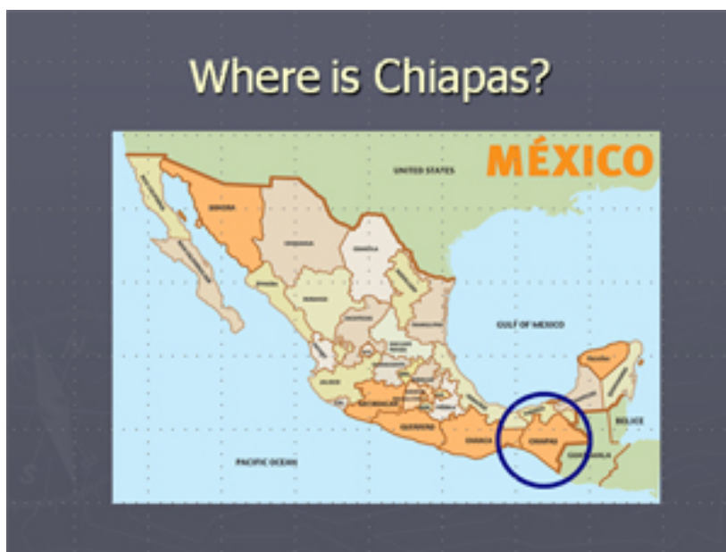
Figure 2. Slide with a map of Mexico and a circle pointing to the Chiapas state.

The video presentation and its discussion usually took about 5 minutes at the beginning of the class. Most of the class time was then devoted to a lecture accompanied by PowerPoint presentations. The instructor usually would show 20-30 slides per lecture. Slide presentations functioned as an aid to the lecture and a tool to display images and maps (see Figure 2 for an example of a map presented in a PowerPoint slide during lecture).