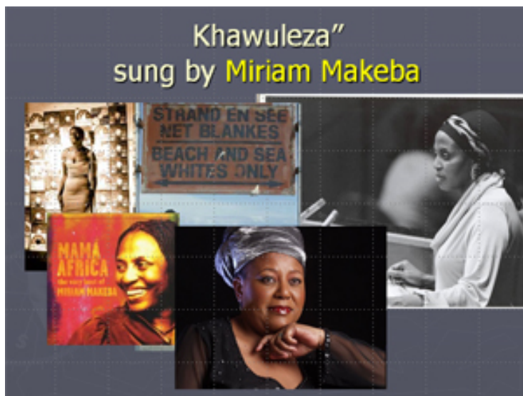
Figure 1. Slide with images of Miriam Makeba presented during lecture.

Lectures represented the dominant form of instruction but had a rather unusual, non-academic prelude. A few minutes before each class, the instructor would play a video clip of a musical performance. As students entered the lecture hall, they were surrounded by sounds of music from the country or region that was to be covered in the lecture. For example, for the lecture on South Africa, students watched a musical performance of Miriam Makeba singing “Khawuleza.” The instructor also presented pictures of Miriam Makeba in PowerPoint and talked about her as a singer and anti-apartheid activist (see Figure 1). The following slide had several links to online resources about Miriam Makeba and her role as a civil-rights activist. Video and audio clips were presented in every lecture and were also used occasionally in discussion sections. Students also used visual and multimedia resources when preparing for the assignments.