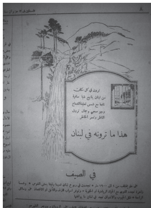
“This is what you'll see in Lebanon in the summer,” Falastin , 3 June 1933, p. 8.

While conveying distinct messages, the two themes formed a complementary portrait of Lebanon as a brand and as a travel experience. Lebanon was presented in these advertisements as healthy and modern—relaxed and picturesque yet closely connected to the modern-day world. It offered visitors a sporty lifestyle along with sophisticated evening entertainment and, as the ads promised, remained “economical.” Perhaps most suggestively, these themes collectively implied that healthy modernity lay outside urban areas, in the mountains where trees and fresh air were plentiful. None of these advertisements so much as mentioned Beirut.