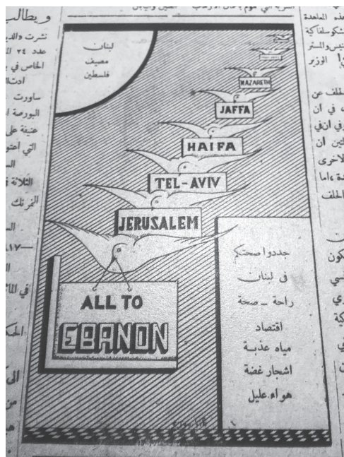
“Lebanon: Palestine’s summer residence” advertisement, Falastin, 20 June 1935, p. 7.